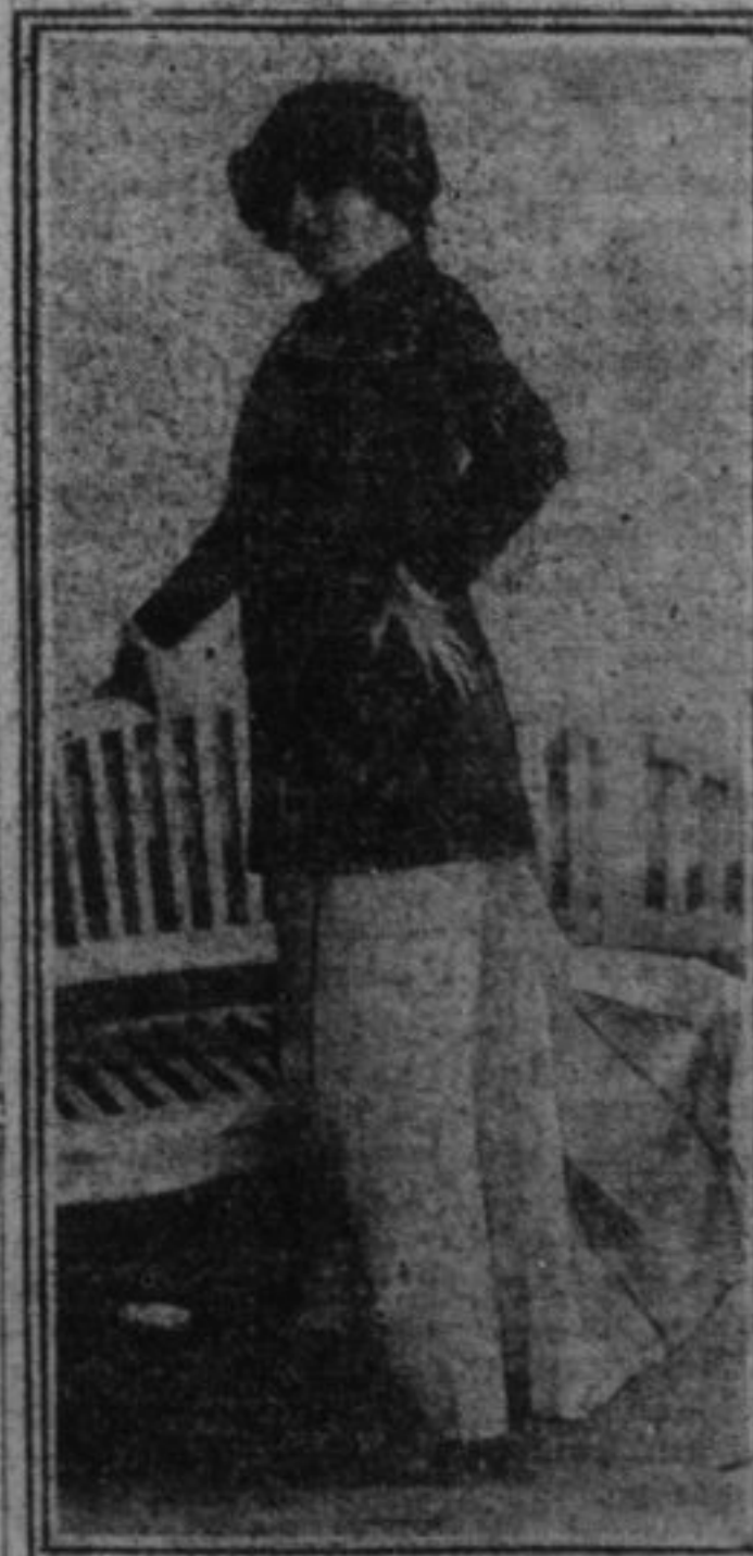
White serge gown with red jacket.