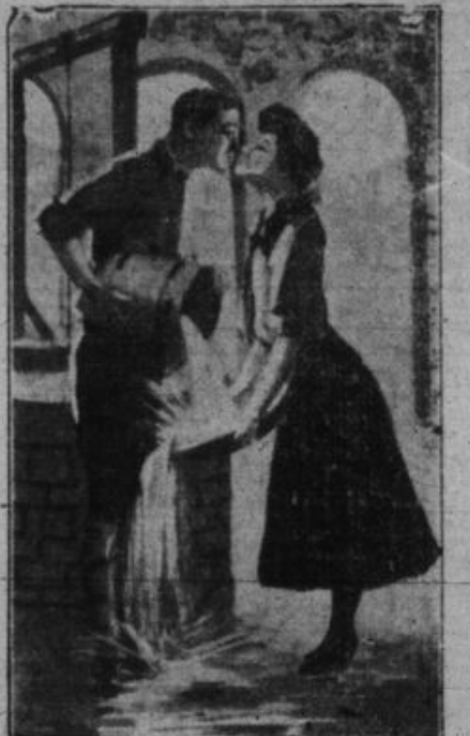
A Scene from "A Knight For a Day," at the Grand, on Tuesday, Sept. 28th.

Madame Nazimova's plans for the coming season which have been definitely announced by the Shuberts include the presentation of one or more new plays and an engagement in New York. The first new play will be "The Passion Flower." This season Nazimova's road tour is intended for early in the new year she goes to New York as the opening attraction for the beautiful new Shubert theatre on Thirty-ninth street. Out of a hundred new plays submitted, Nazimova has found two which have so impressed her that one has been selected for her road tour and the other will be given a production within a short time. Both are by new authors. While Madame Nazimova has temporarily laid aside herself she has by no means given up his plays. It is also among the possibilities that later in the coming year she will appear in a play which Eugene Walter is under contract to write for her.