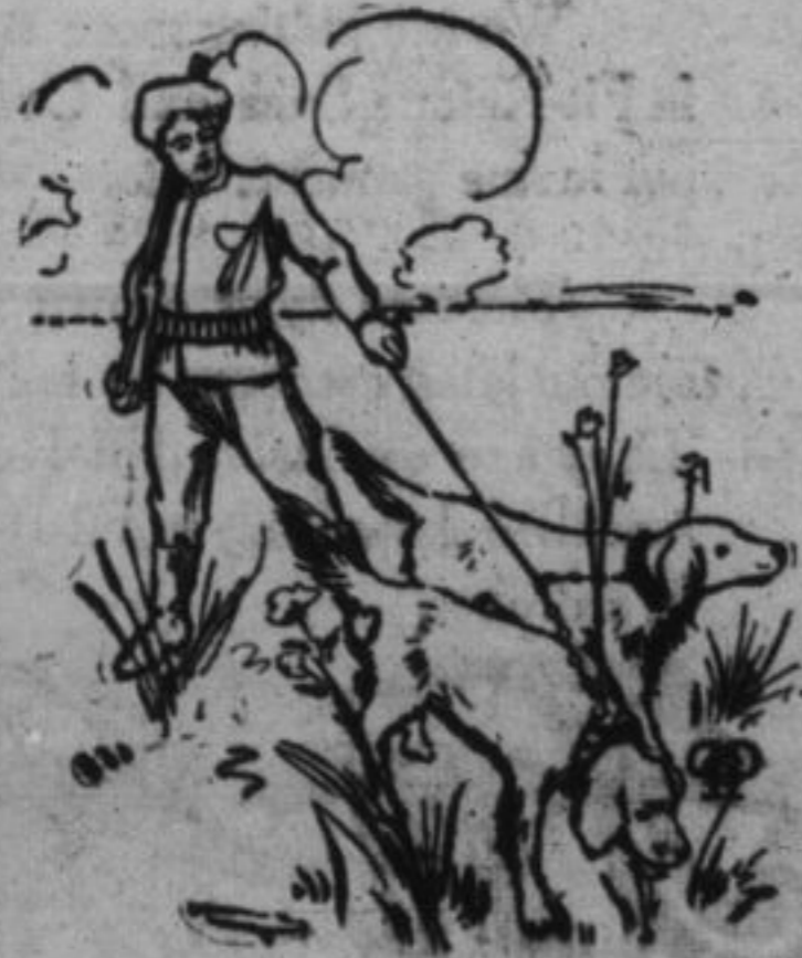
This is the time of the year the Sportsman delights in getting in the Country with Dog and Gun. For your needs we can furnish you with everything except Dog and Gun for a good days sport with sure shots try 1 box W. M. C.

ARROW SHEETS—Sheets from 50c Box up. Guaranteed. W. A. Mitchell's Hardware Kingston.