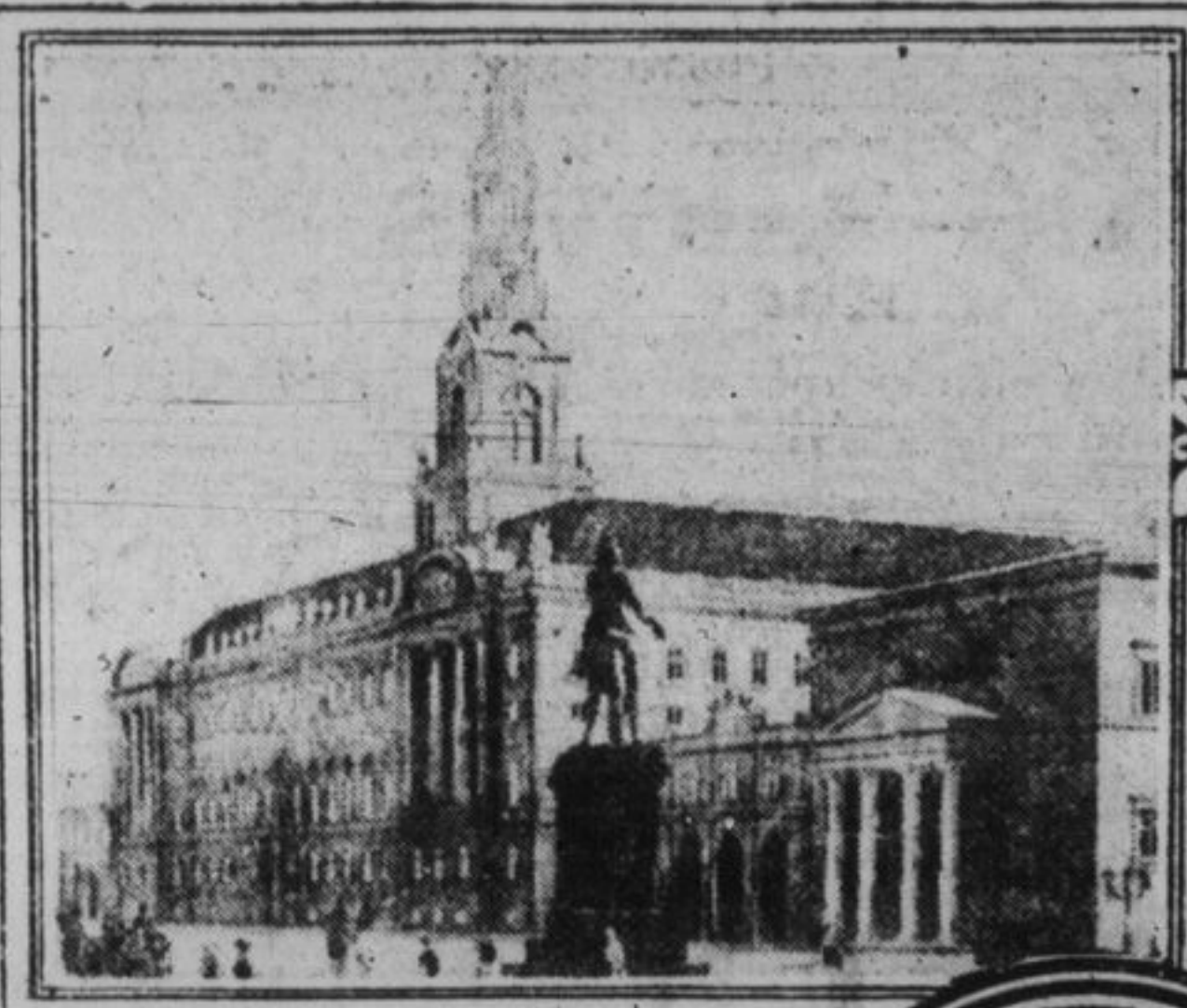
THE NEW PALACE OF THE KING CHRISTIANSBORG, CASTLE