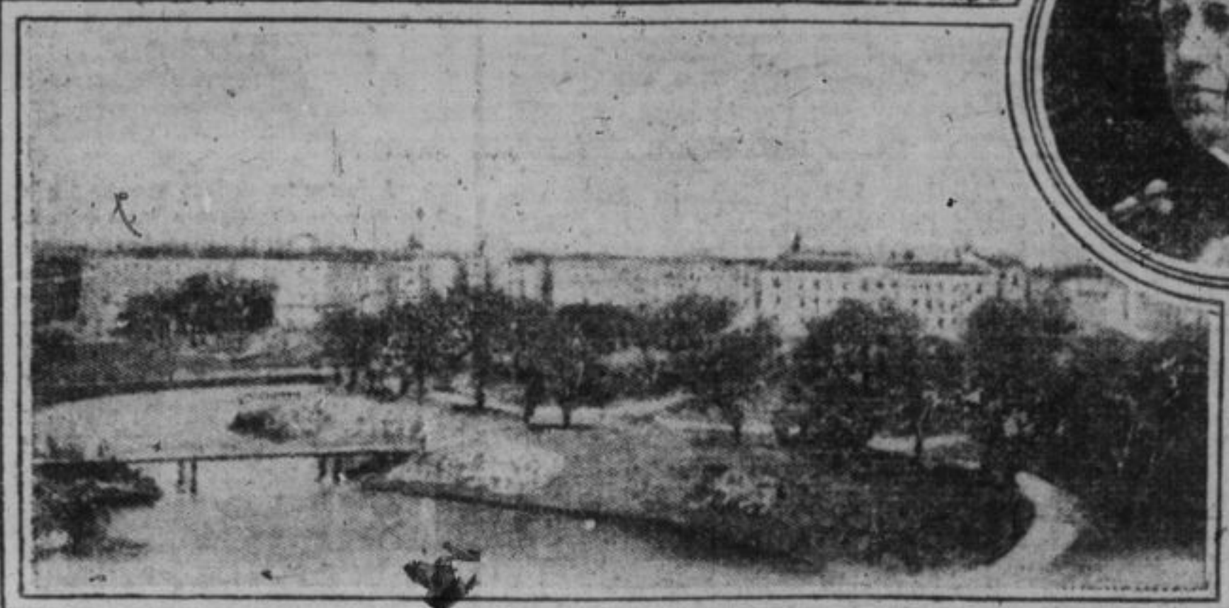
H. C. OERSTED PARK, COPENHAGEN.