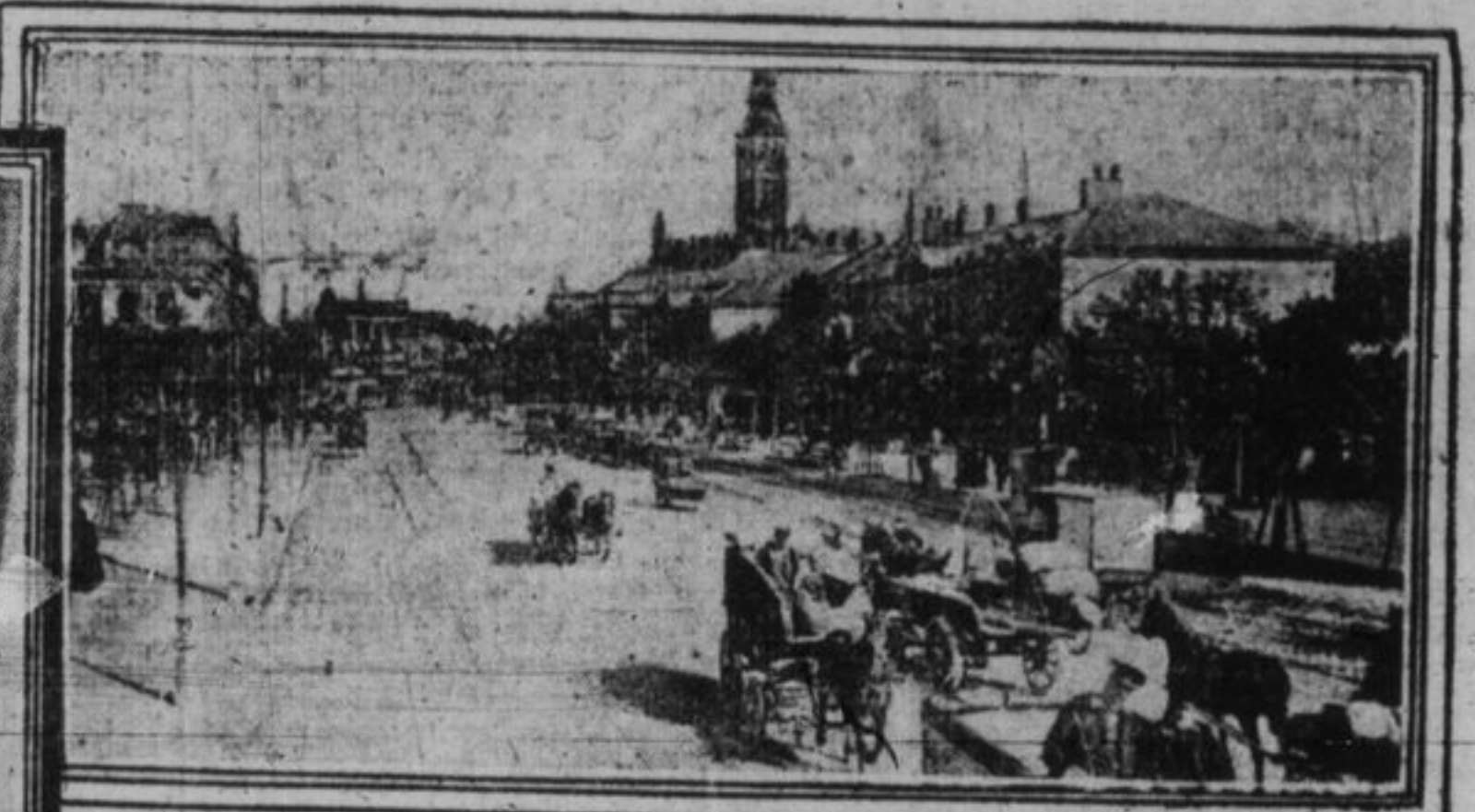
VESTERBRO'S PASSAGE, ONE OF THE MAIN STREETS, COPENHAGEN.