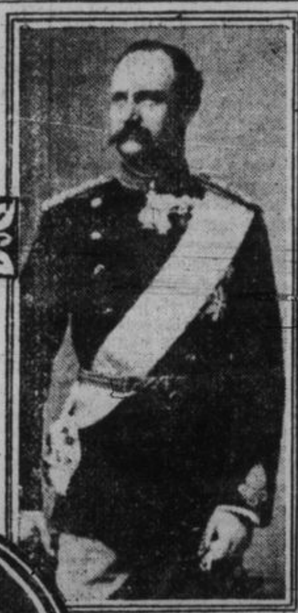
KING FREDERICK VIII OF DENMARK