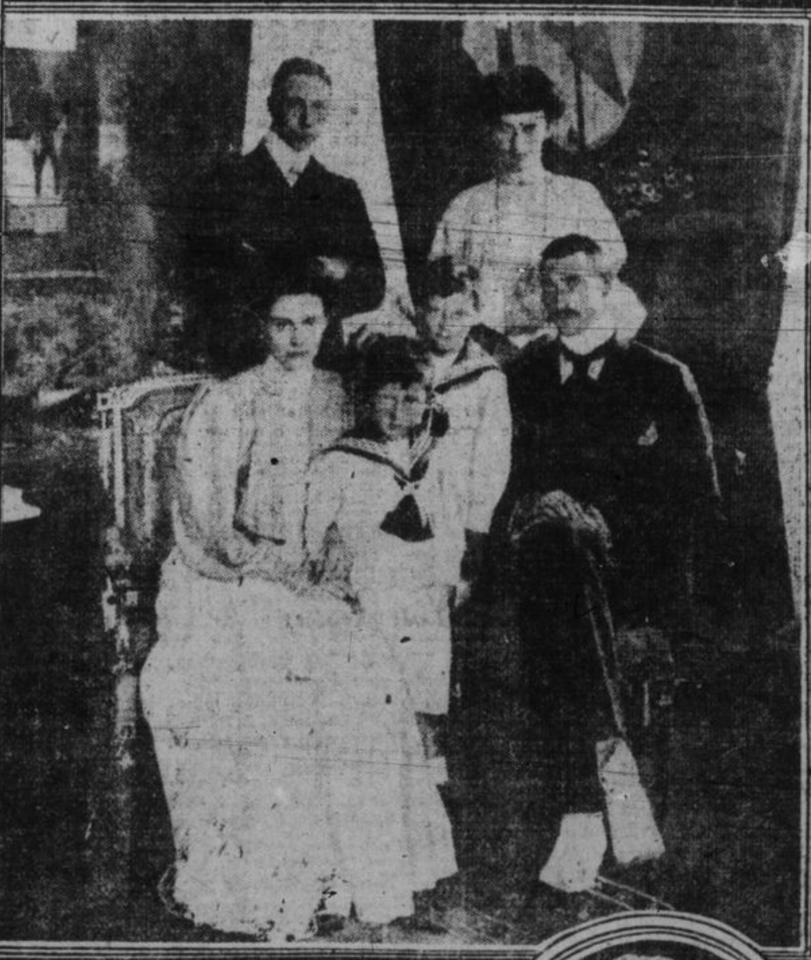
THE CROWN PRINCE OF GERMANY, THE CROWN PRINCESS OF DENMARK, THE CROWN PRINCESS OF GERMANY, THE CROWN PRINCE OF DENMARK AND TWO INFANT DANISH PRINCES