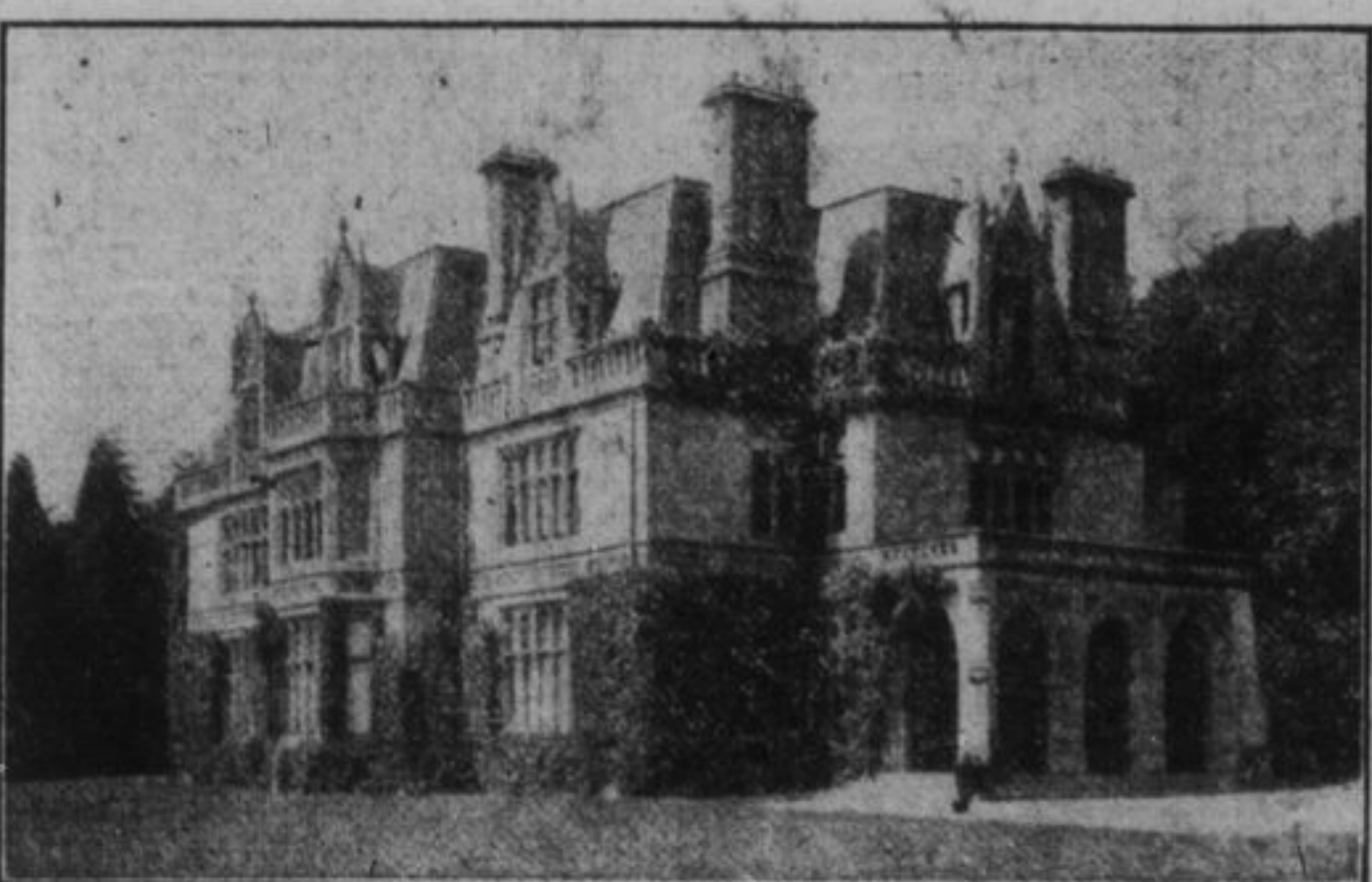
ALDWORTH—LORD TENNYSON'S LATER RESIDENCE.

Though Byron and Shelley were dead, Scott and Wordsworth were still living when Tennyson published his first poems.