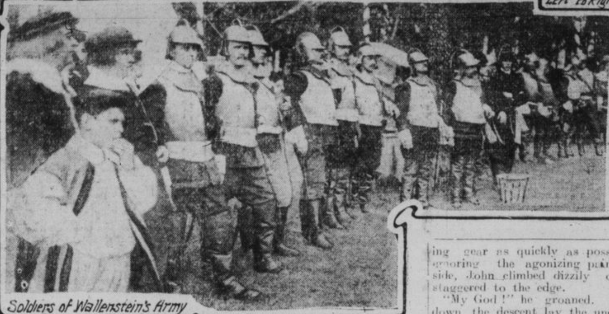
Soldiers of Wallenstein's Army

Five thousand Germans began the celebration of one hundred and fiftieth anniversary of the birthday of Frederick von Schiller, the famous German Poet, by an admirable open air dramatic presentation of his great poem "The Camp of Wallenstein."