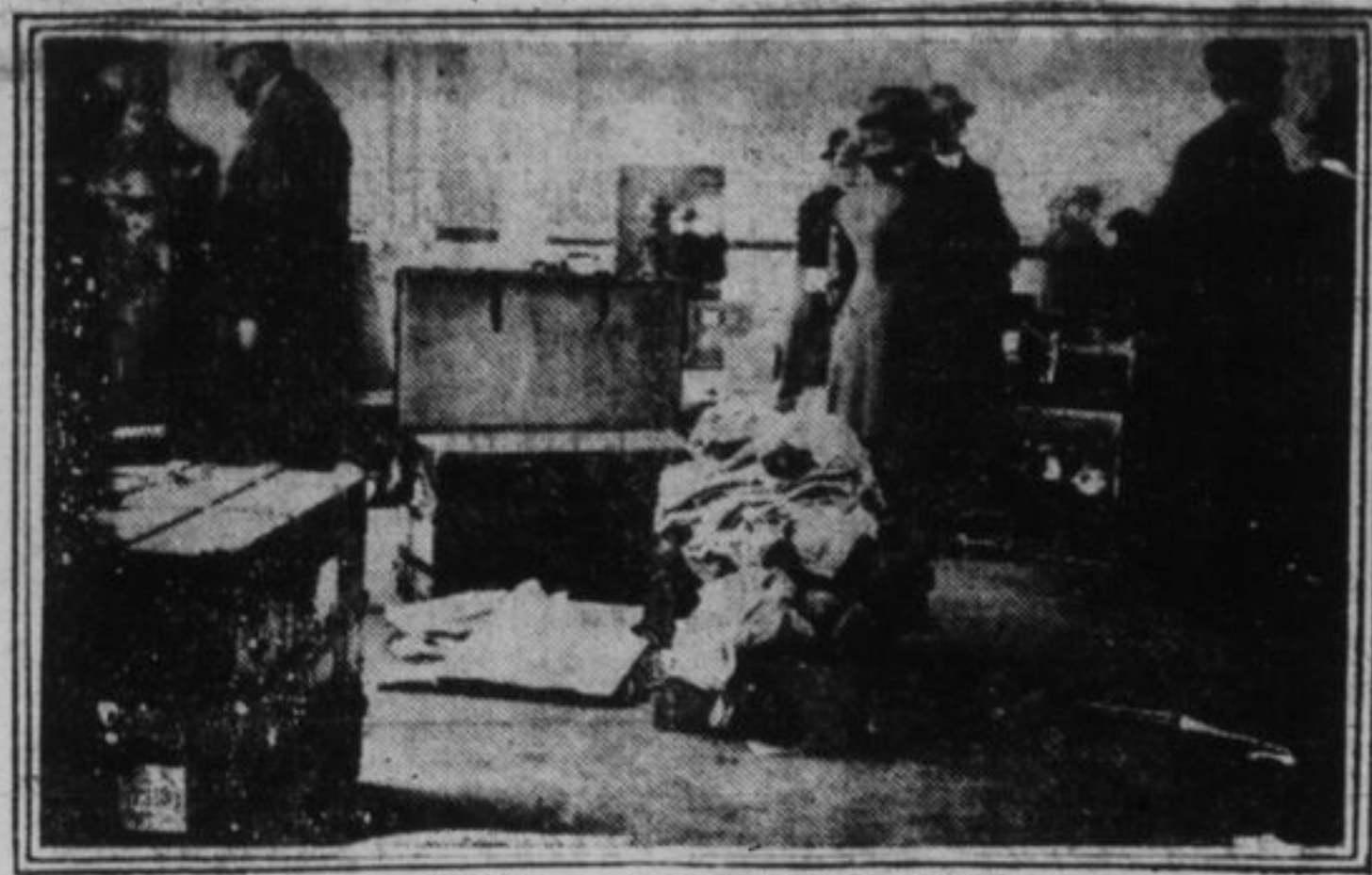
OVERHAULING BAGGAGE ON THE PIER

Battersea, June 21.—This locality seems to be in the dry belt again this summer. The good rains appear to stop within a few miles south and west of here every time. Entrance examinations began this morning in the village school. A goodly number