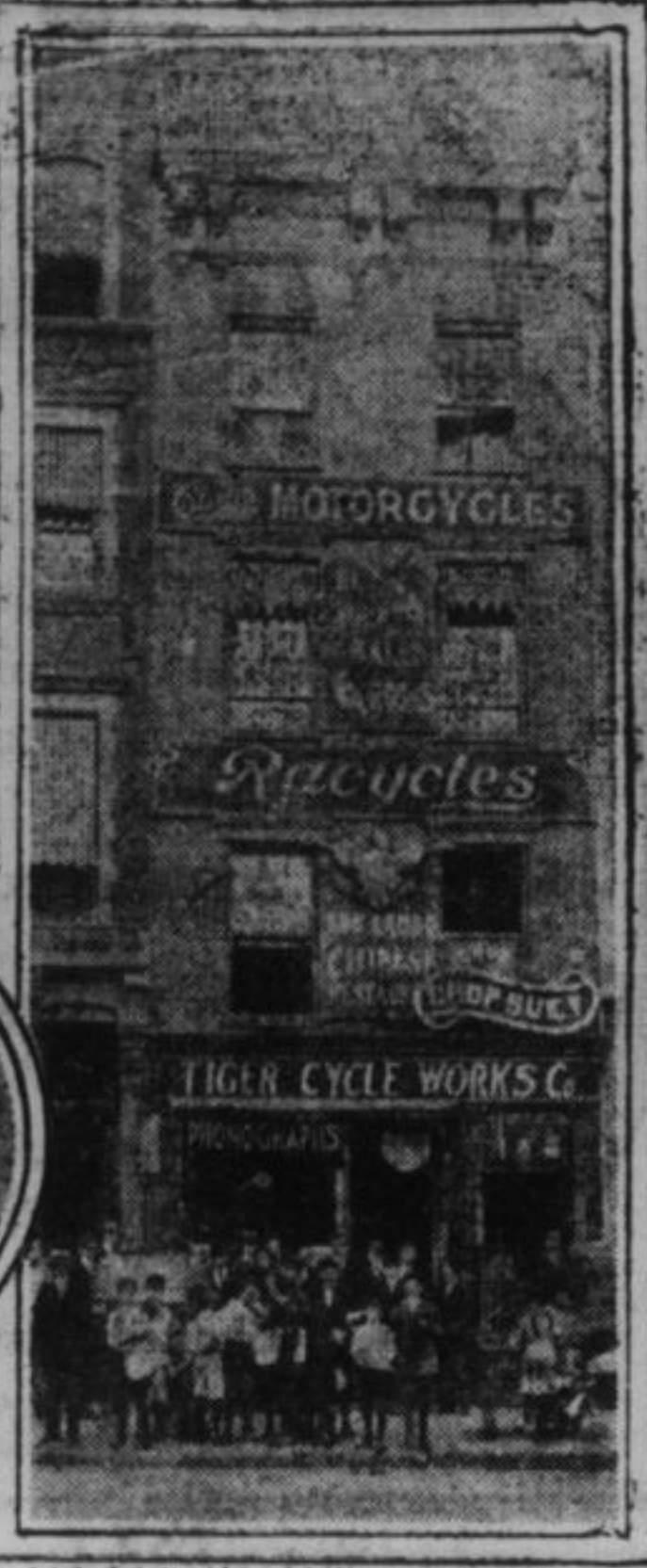
NO 782 EIGHTH AVENUE