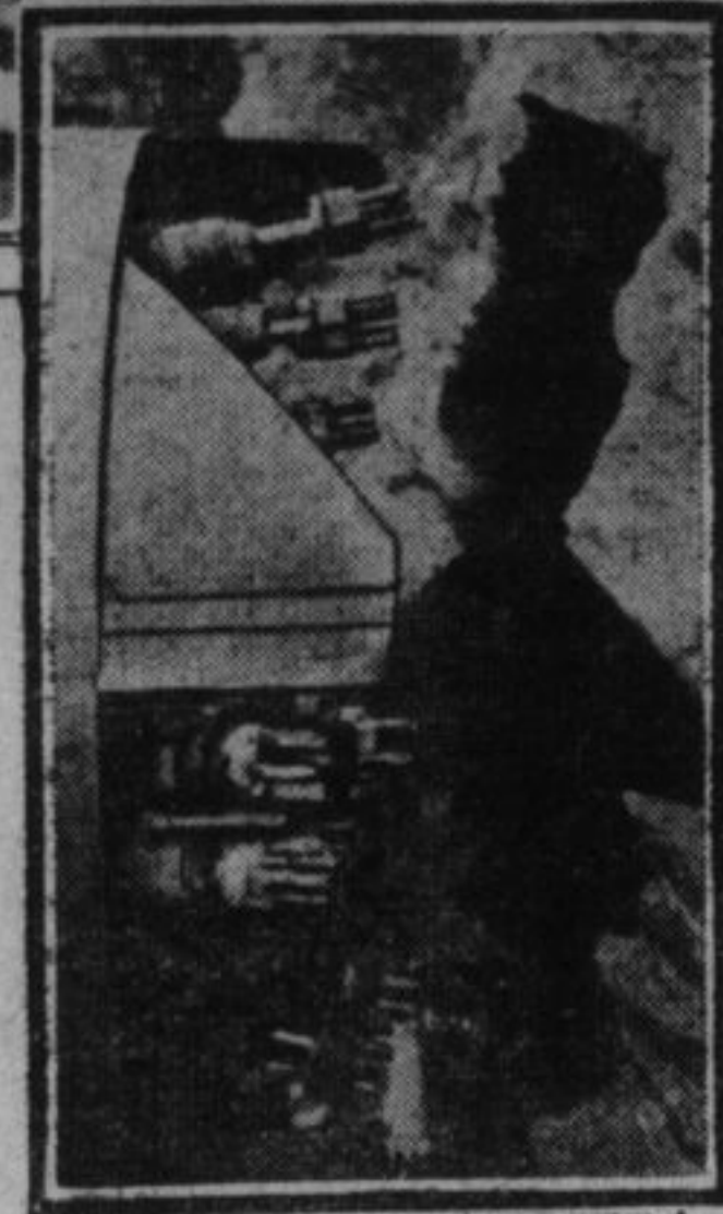
THE DRILLS AND SCRAPERS.

The libellula blue I saw worn in a very striking-looking gown of satin, dense-fitting, and slightly high-waisted, cut with a long, narrow, pointed train. The entire front and back panels of the dress were worked in tubular beads of dull jet in a sort of semi-conventionalized design of the