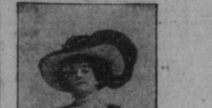
A PROTONE FIGURE.

We want every man and woman who is run-down, or who wants to put on more flesh, no matter how much or how little, to prove the remarkable effects of the new flesh-builder and nerve strengthener, Protone. Nothing like it has ever been produced before. It will cost you nothing to try it and prove its remarkable effects on yourself.