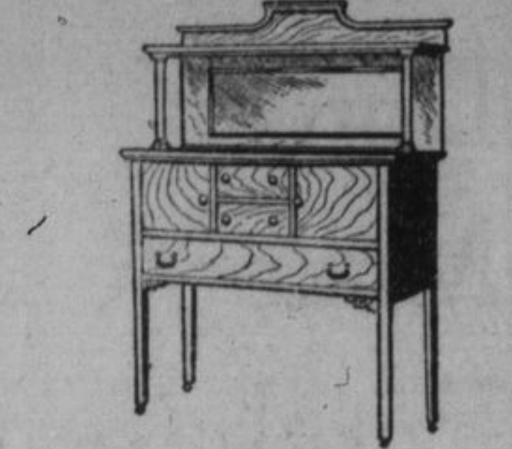
BUFFETS, CHINA CABINETS, EXTENSION TABLES, CHAIRS, all for Dining Room and to match.