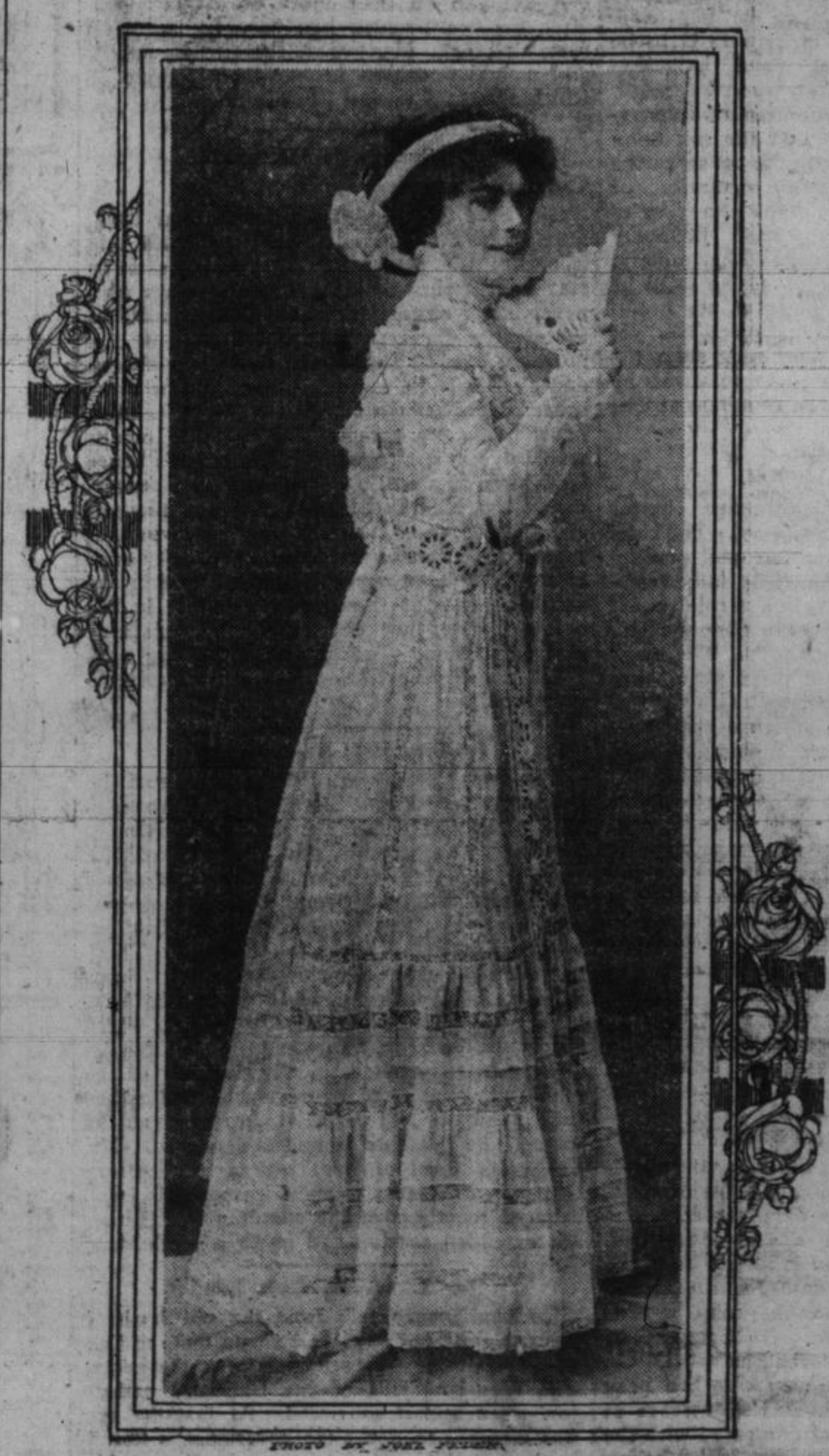
The girl graduate's frock should be of the finest fabric, and its trimmings may be dainty, but the effect must be simple and youthful.

An ideal graduation costume is illustrated here, the frock of soft white mull, guileless of any stiffening, and the trimmings so arranged as to give an effect of slenderness and grace.