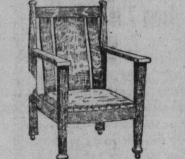
Our Early English Mission Designs are the latest, and give a tone and uniqueness to your room, not easily obtained.

TAILOR SUITES, $30, $37, $48. Three new designs. They're up to now, and look as good, and last as long as $50 and $75 styles.