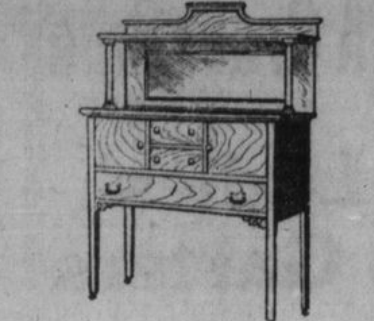
BUFFETS, CHINA CABINETS, EXTENSION TABLES, CHAIRS, all for Dining Room and to match.

May House-Furnishing Rush is now on. We're getting it, and everybody looks happy. Stock and prices produce that effect.