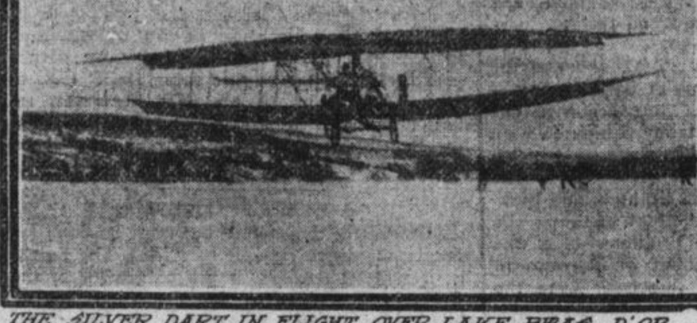
THE SILVER DART IN FLIGHT OVER LAKE BRAS D'OR, BADDECK, N. S.

Mr. McCurdy, who is just twenty years old, is one of the two engineers employed by Dr. Bell in the construction of his experimental flying machines. As a result of the experiments