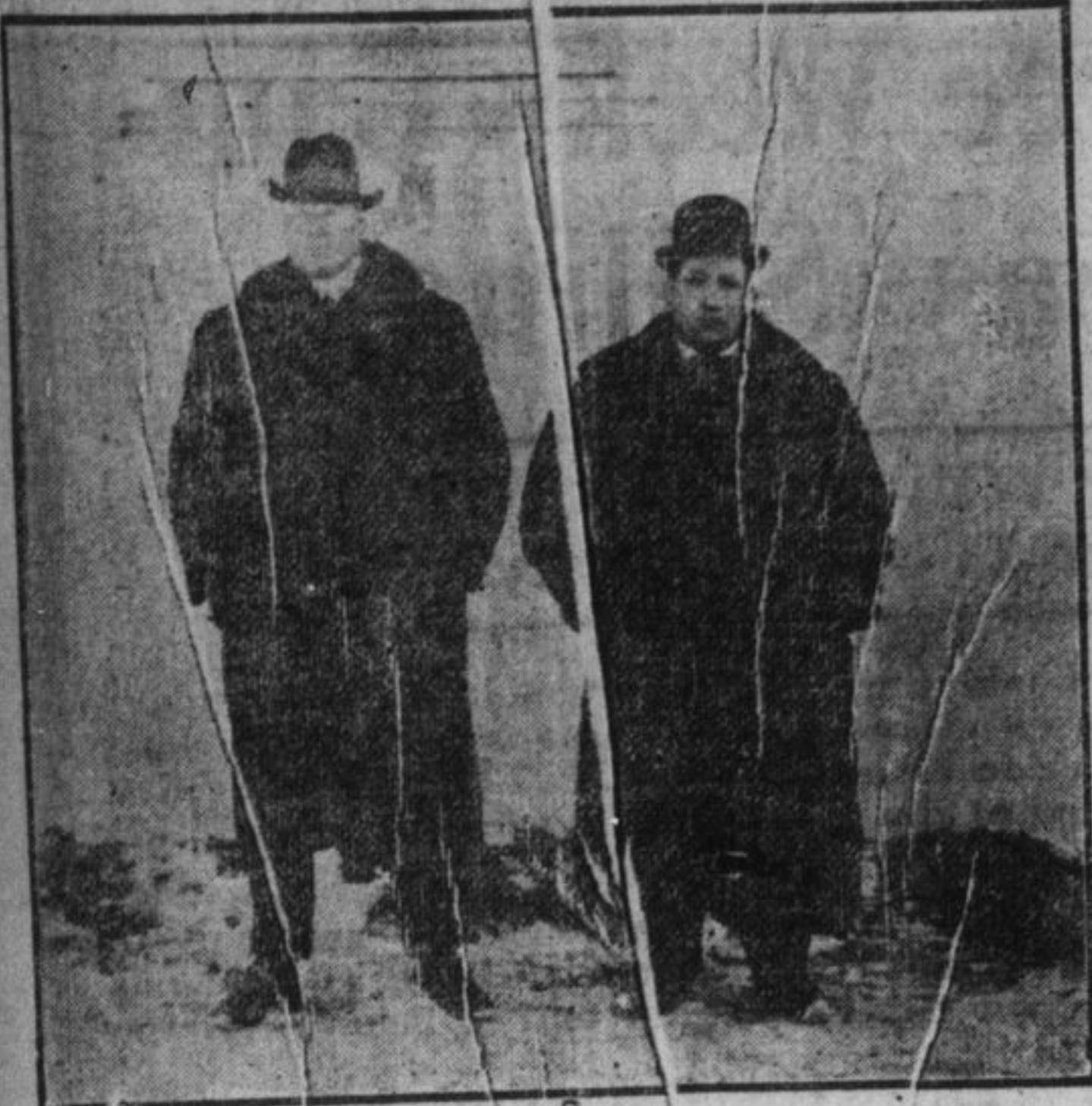
TOM SHARKEY. The ex-heavy-weight pugilist and his travelling companion who are taking in the ice-racing in Canada. They are at present in Montreal.