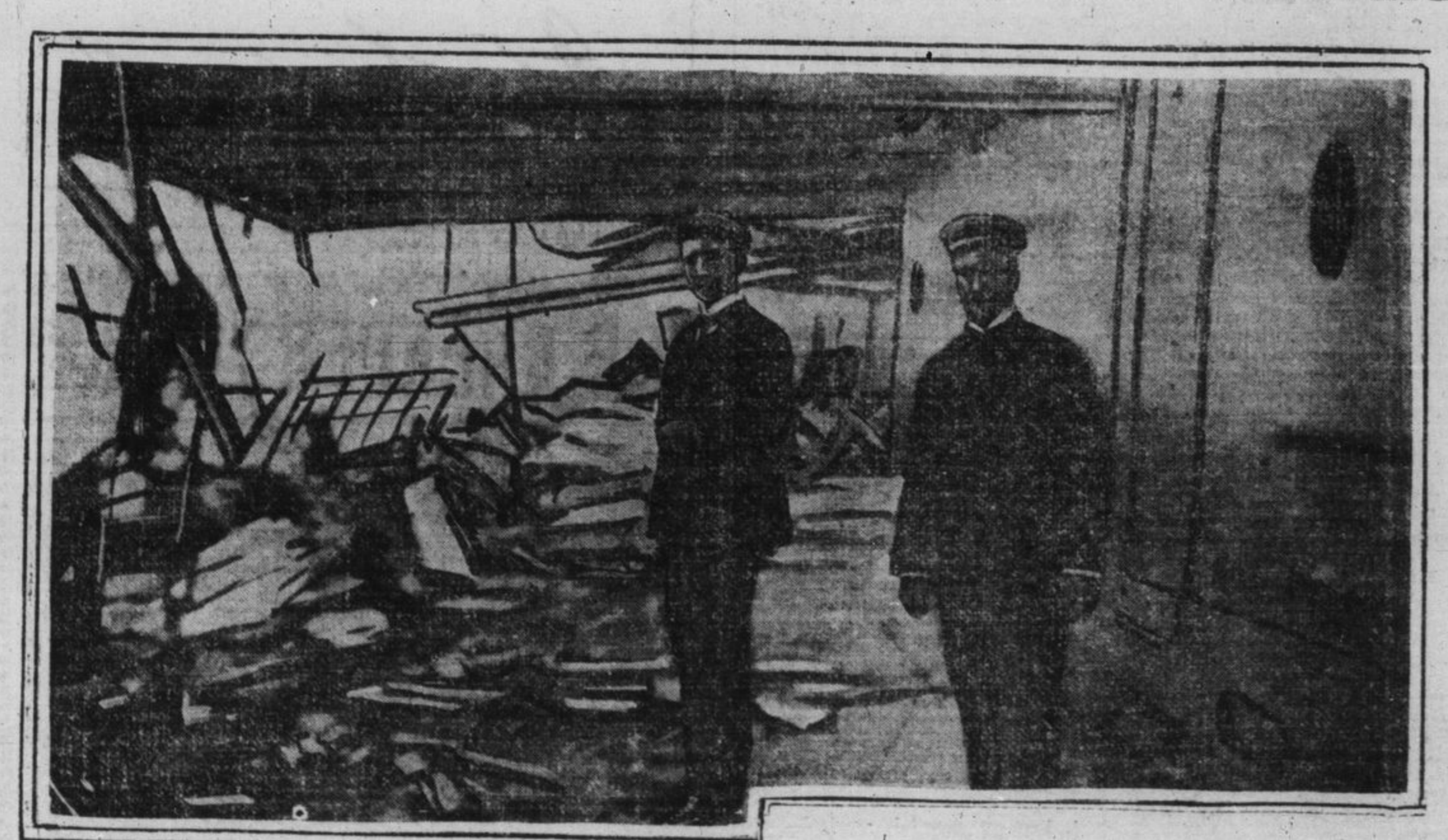
Deck of Republic near coast made by collision.

When a contrary man agrees with you it's safe bet you are wrong. Every time some people say smart things they make other smart.