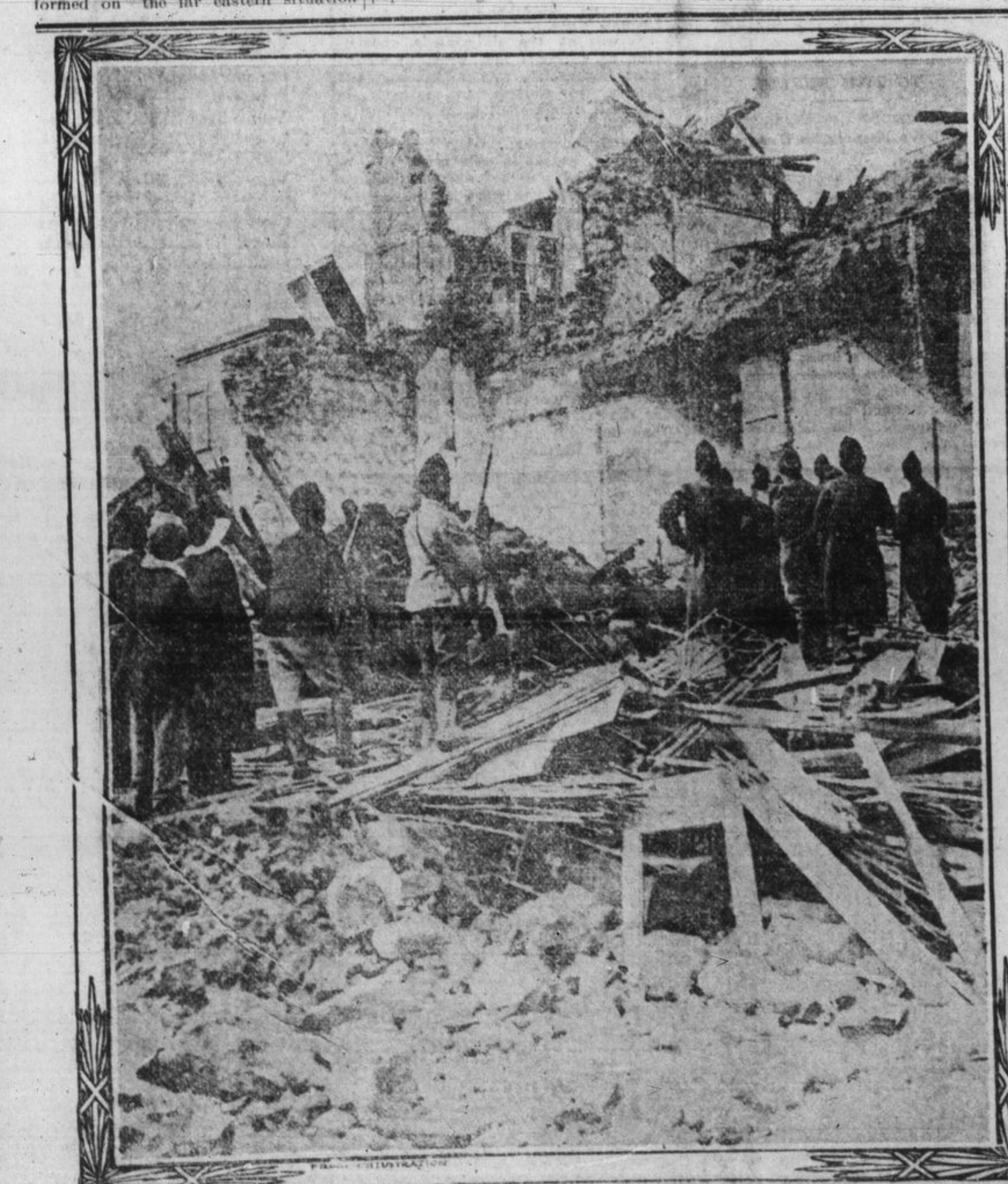
THE CHASE OF A LOOTER AMONG THE RUINS

young woman, who is very pretty, with fine black eyes and hair and a wonderfully clear complexion, and who is as ardently devoted to the cause of reform for her country as is her parent. "Yuan pretended to have the reform interest at heart, but he affected to espouse the new order of things only as a matter of personal benefit to himself. He saw that that was the "Prince Ching, who brought about Yuan's overthrow, is real progressive, whose father many persons well informed on "the far eastern situation