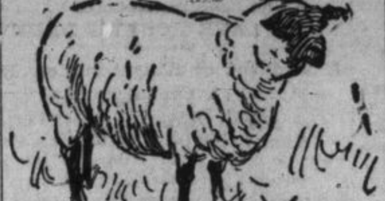
A SUFOLK SHEEP.

Care must be taken, however, to so place or protect it that they will not fall into it and drown. Sheep are naturally helpless animals, and when chilled and wet particularly, do little to save themselves. A sheep drowned in a large tank is not an uncommon occurrence. This may happen in a number of ways, one of the most common is that of a large number of sheep crowding up to the trough at one time, those behind pushing the