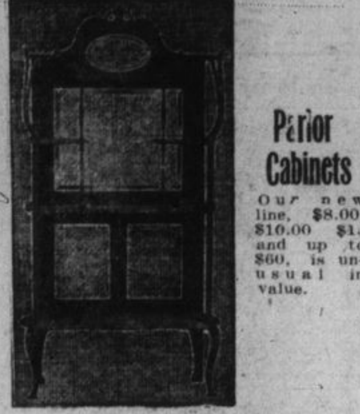
MUSIC CABINETS. Some beauties, at $4.50, $5.50, $8 up.

If you spend your money wisely, and our lines have wisdom and happiness all over them.