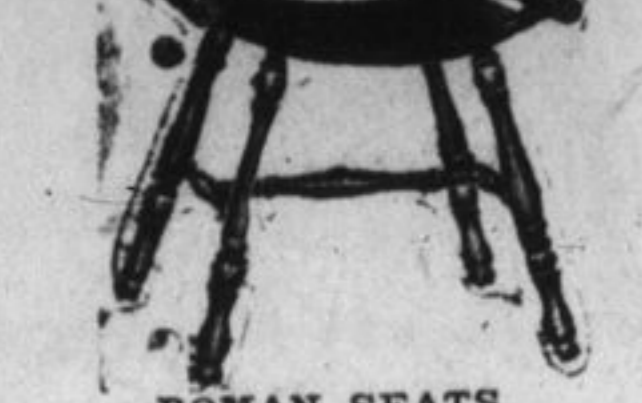
ROMAN SEATS. See window display. Our Christmas Price, only $1.50, in Velour Upholstering.

Fancy Parlor Tables Small, 50c. $1, $1.25, large size, $1.50, $2.50, $3.75 up to $30 each. A large assortment in oak and Mahogany.