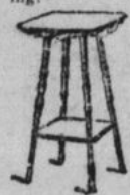
Fancy Parlor Tables

See window display. Our Christmas Price, only $1.50, in Velour Upholstering.