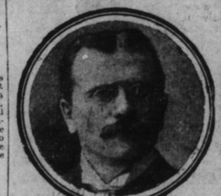
Hon. L. P. Brodeur

And Re-organize the Department - Hugh Allan congratulates Mr. Brodeur for Improving St. Lawrence Route.