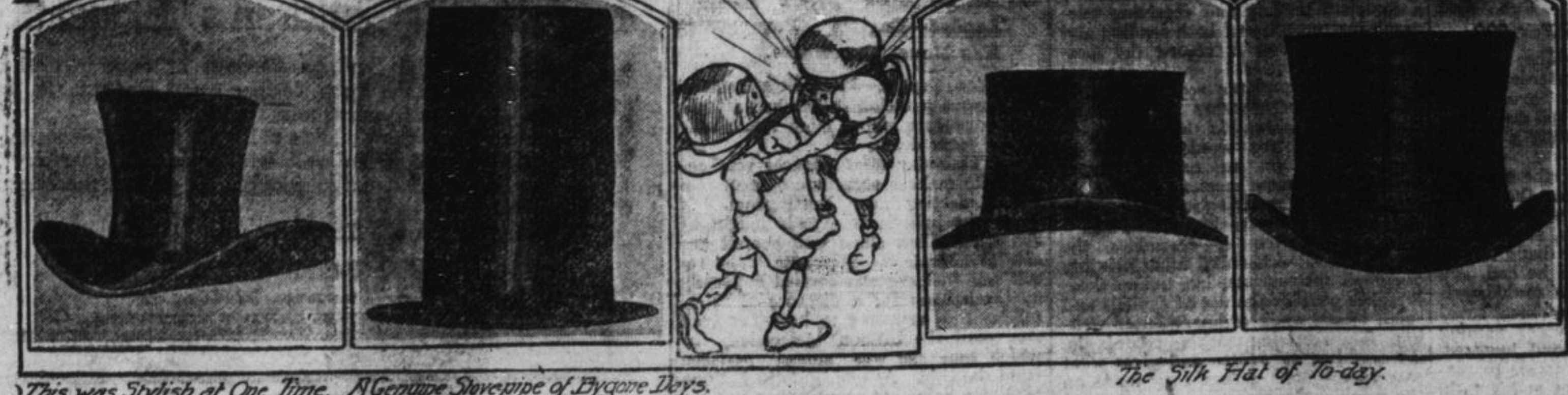
This was stylish at one time. A genuine stereoscope of bygone days.

Going! Going! Going! The summer girl? No, something less attractive, but a more important thing to many men—the silk hat!