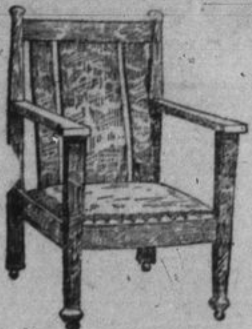
Mission Furniture, for Hall, Library, Dining Room, Etc., all sets in price for this sale.

Summer Sale of Furniture, Carpets, &c. Your Chance To Save Money.