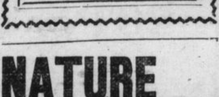
LYDIA E. PINKHAM

Nature and a woman's work combined have produced the grandest remedy for woman's ills that the world has ever known. In the good old-fashioned days of our grandmothers they relied upon the roots and herbs of the field to cure disease and mitigate suffering.