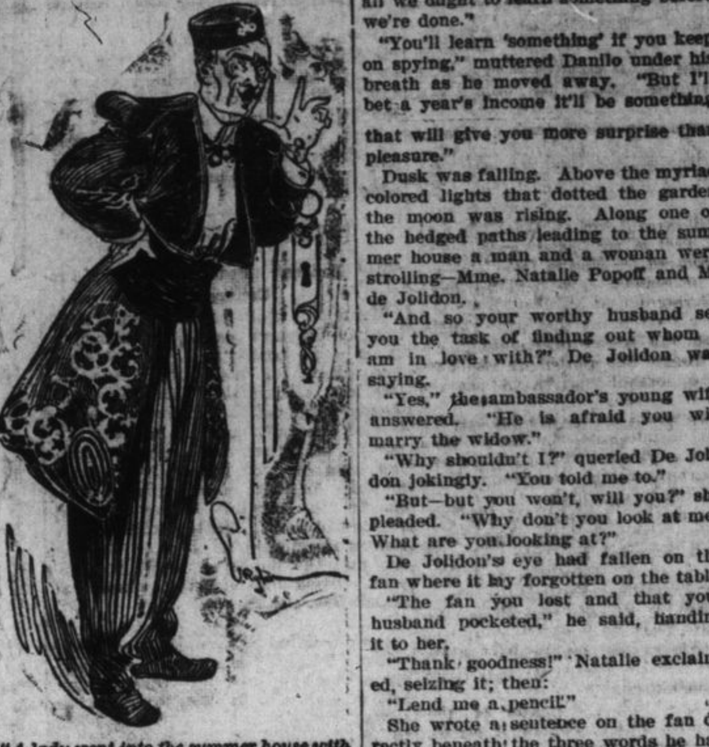
"A lady went into the summer house with a gentleman."

It was a strange, dexterous blend of east and west of Ilsonan oriental posturing and of gliding, modern waltz steps—the very poetry of motion.