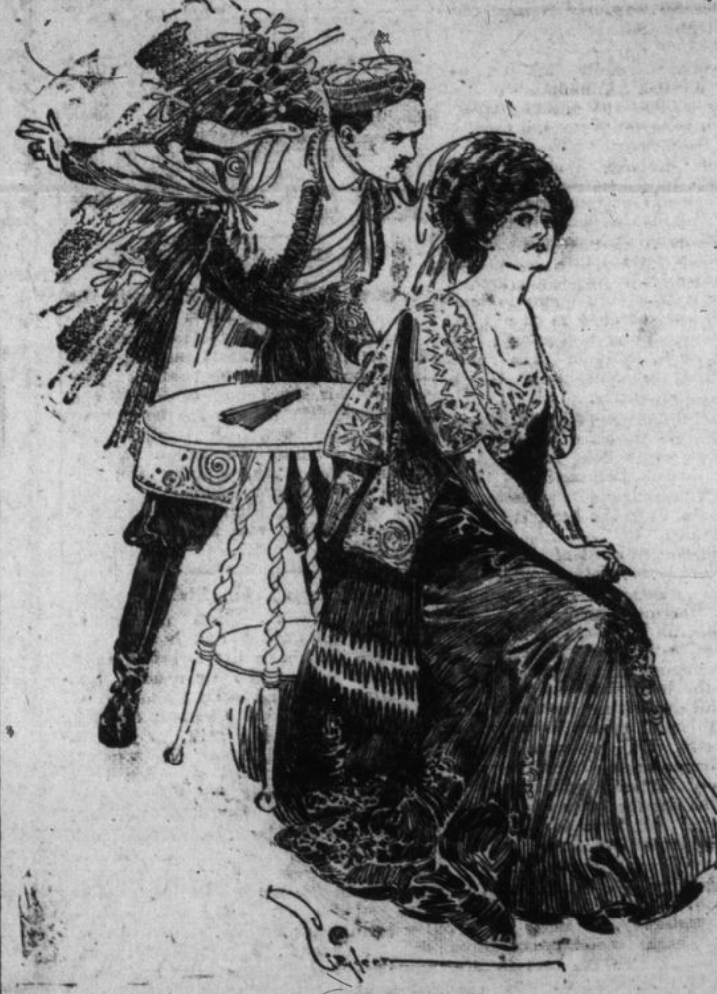
"I'M AWAKE FROM MY CRAZY DREAM OF LOVE, AND I'M GOING BACK TO MAXINE."

what sullen pride forced back from the lips. Then last dreamy chord and the music was hushed. Danilo and Sonia started, amazed, as though from some vision of paradise.