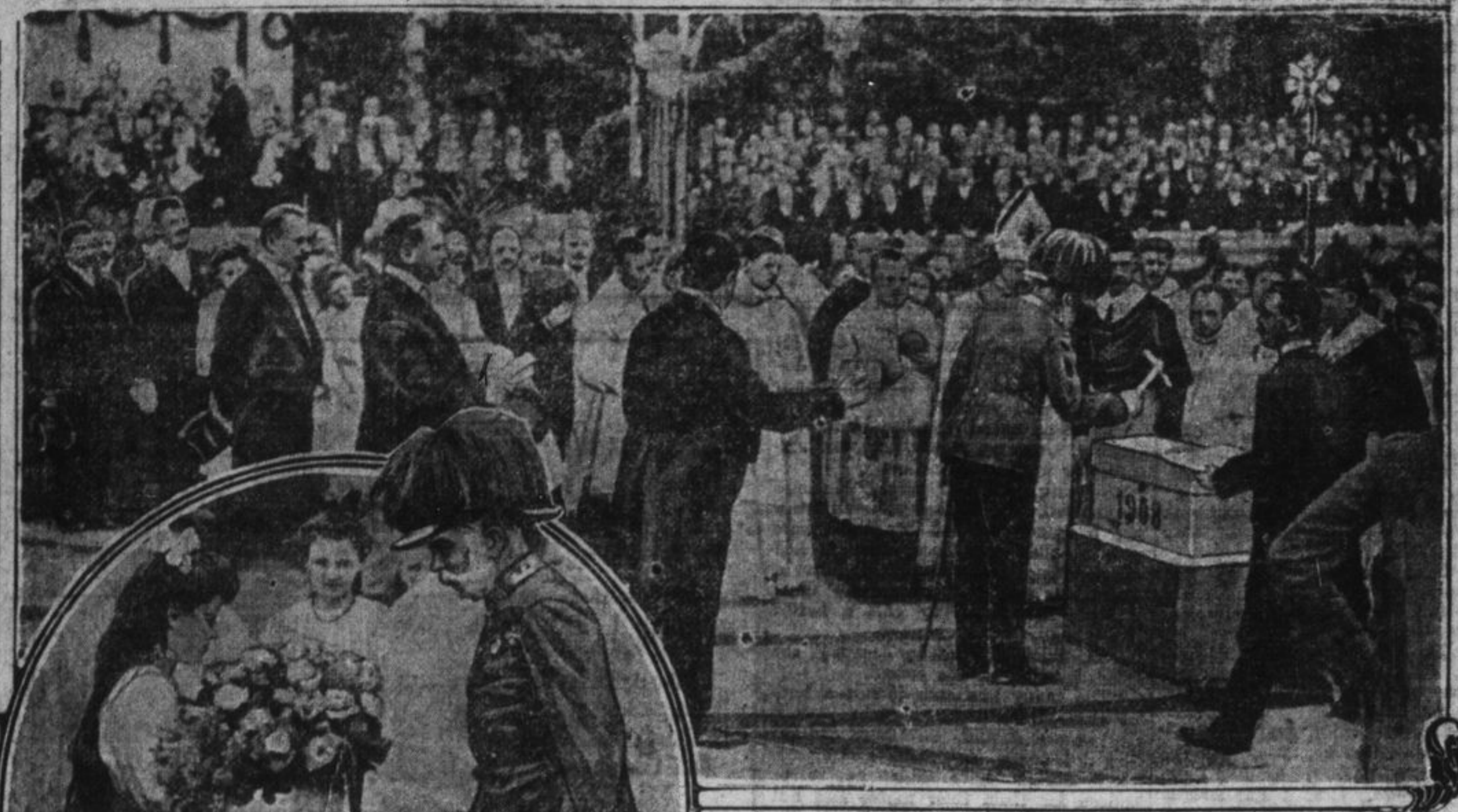
The Emperor lays the Foundation Stone of an Asylum for Foundlings