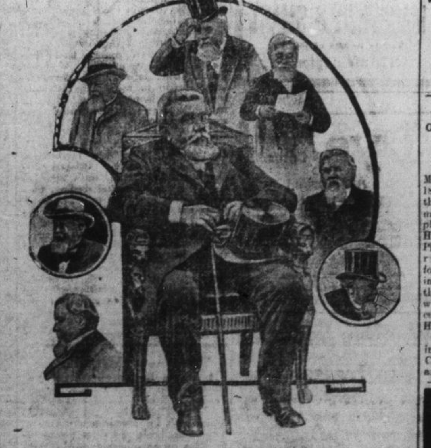
FRANCE'S PRESIDENT IN MANY POSES. M. Fallieres, President of France, arrived in London on May 24 to visit the Franco-British Exhibition. He was accorded all the honors extended to royalty, and was most cordially received by the king, the royal family and the English people.

No one knows better than those who have used Carter's Little Liver Pills what relief they have given when taken for dyspepsia, dizziness, pain in the side, constipation and disordered stomach.