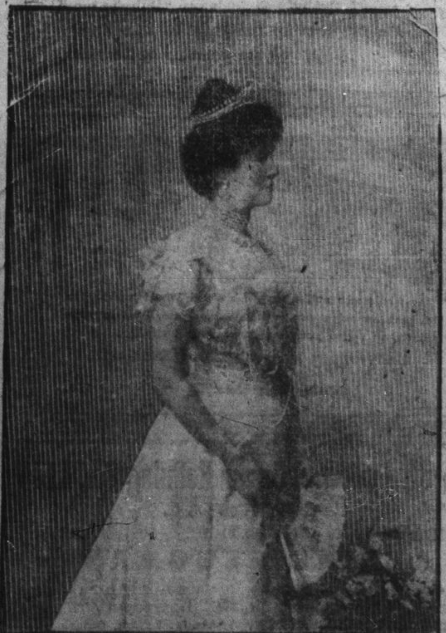
LADY MINTO, Who is a Great Force in India's Official Circles.