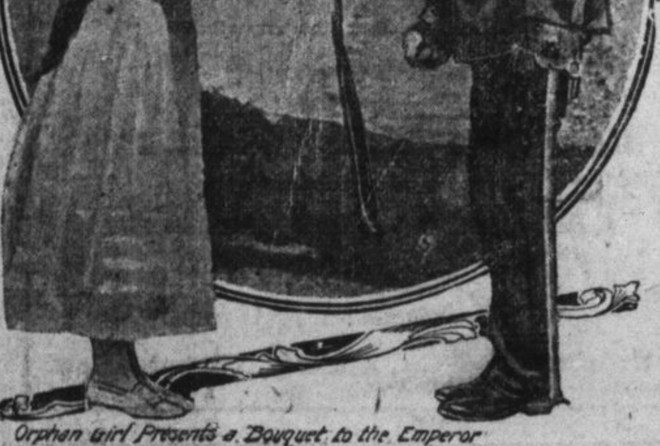
Orphan girl Presents a Bouquet to the Emperor