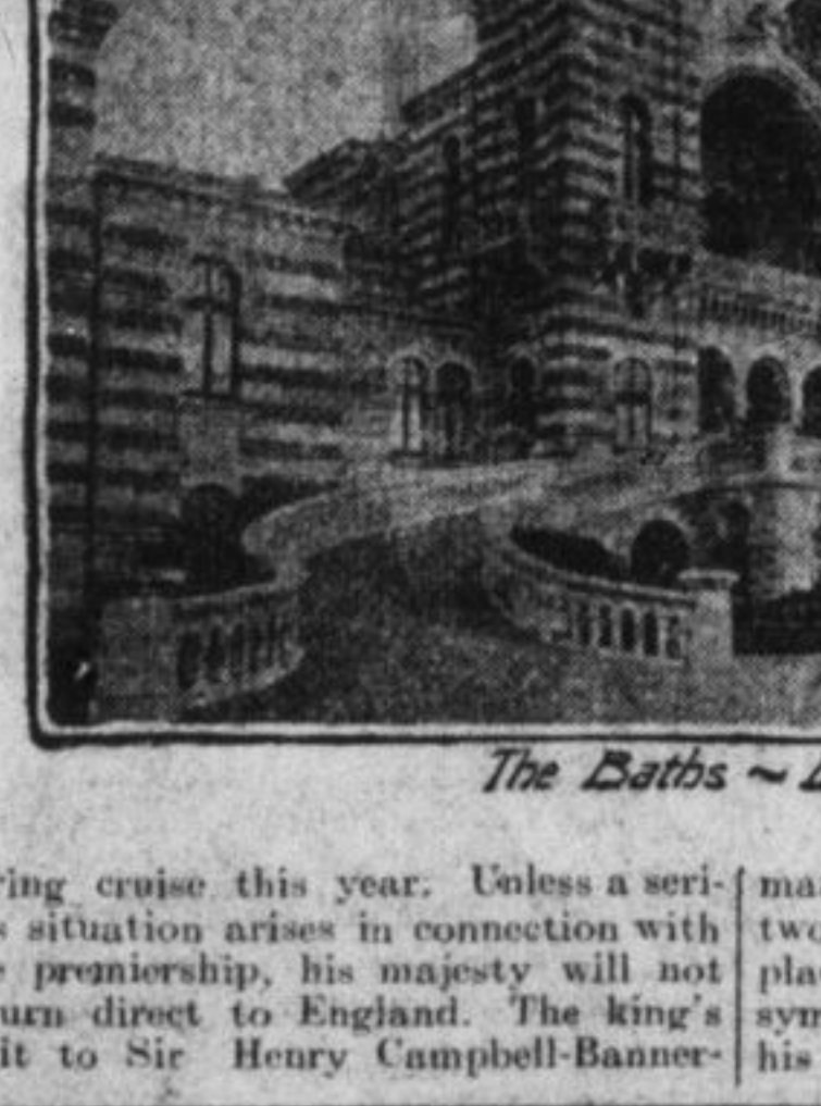
The Baths - Biarriz

There is no truth in the statement which has been rather widely circulated that a meeting will take place in the near future between King Edward and King Victor Emmanuel, and that his visit to Biarritz is simply a preliminary to a cruise in the Mediterranean and a subsequent visit to an Italian port. There is really no international question of importance at the present moment calling for the necessity of a meeting between the two monarchs.