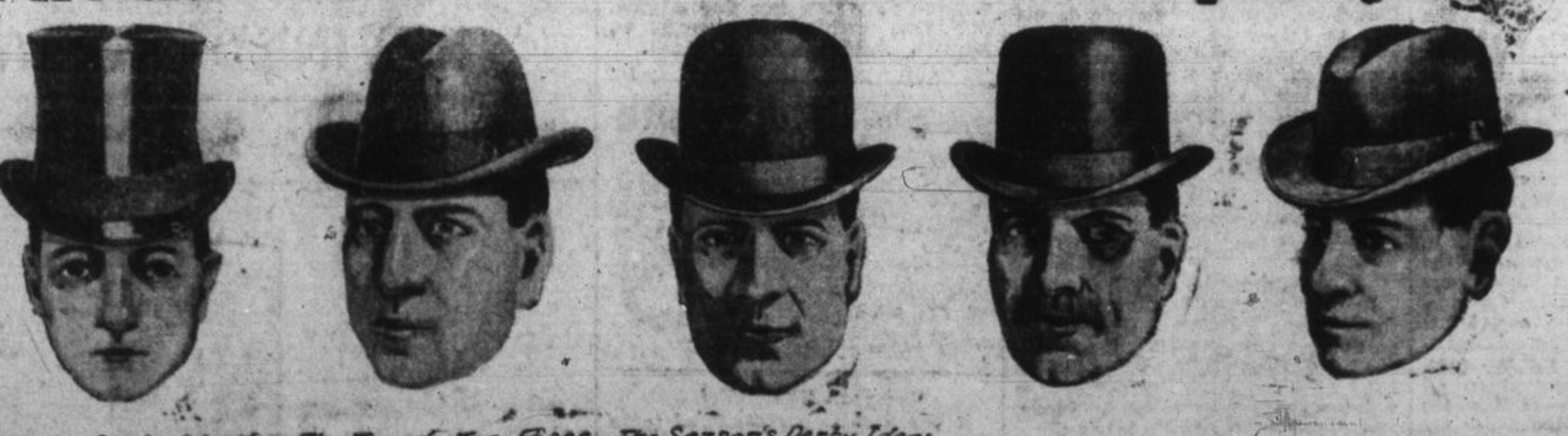
When You Go the Limit The Tuxedo Top Piece The Season's Derby Idea.

Of course, the question, "Wherewith shall a man be covered?" is not nearly so important as that which concerns women. But the styles of men's hats are matters of no little importance to the artists whose purpose is to create some new and attractive headgear for the sterner sex. New styles in hats for men? Certainly. Hardly as conspicuous as the Italian garden and Japanese mountain effects, with the popular ornithological creations of the women, perhaps. But each season there's something new for the men.