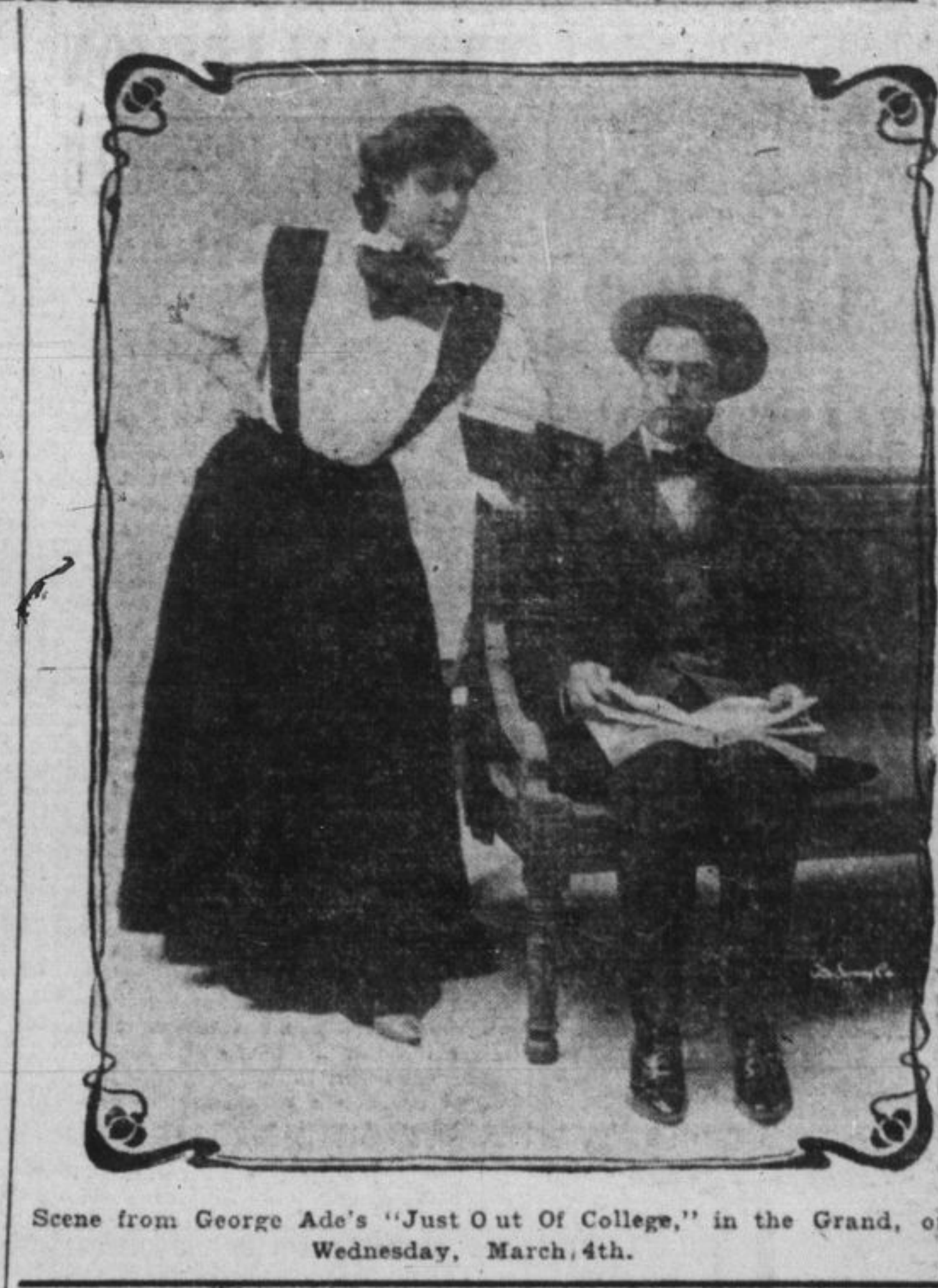
Scene from George Ade's "Just Out Of College," in the Grand, on Wednesday, March 4th.