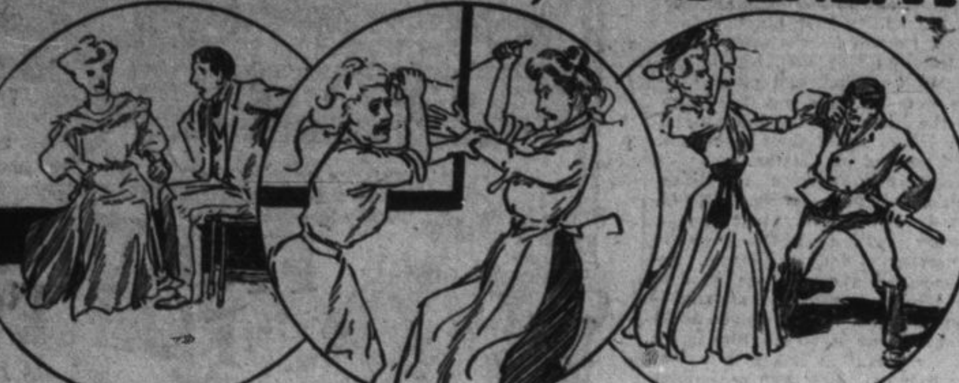
Playfully Stabbed Lover's Head, He Laid Leg Fatal Hatpin Duel in a Paris Street Her Hatpin Saved 5,000 from Highwaymen