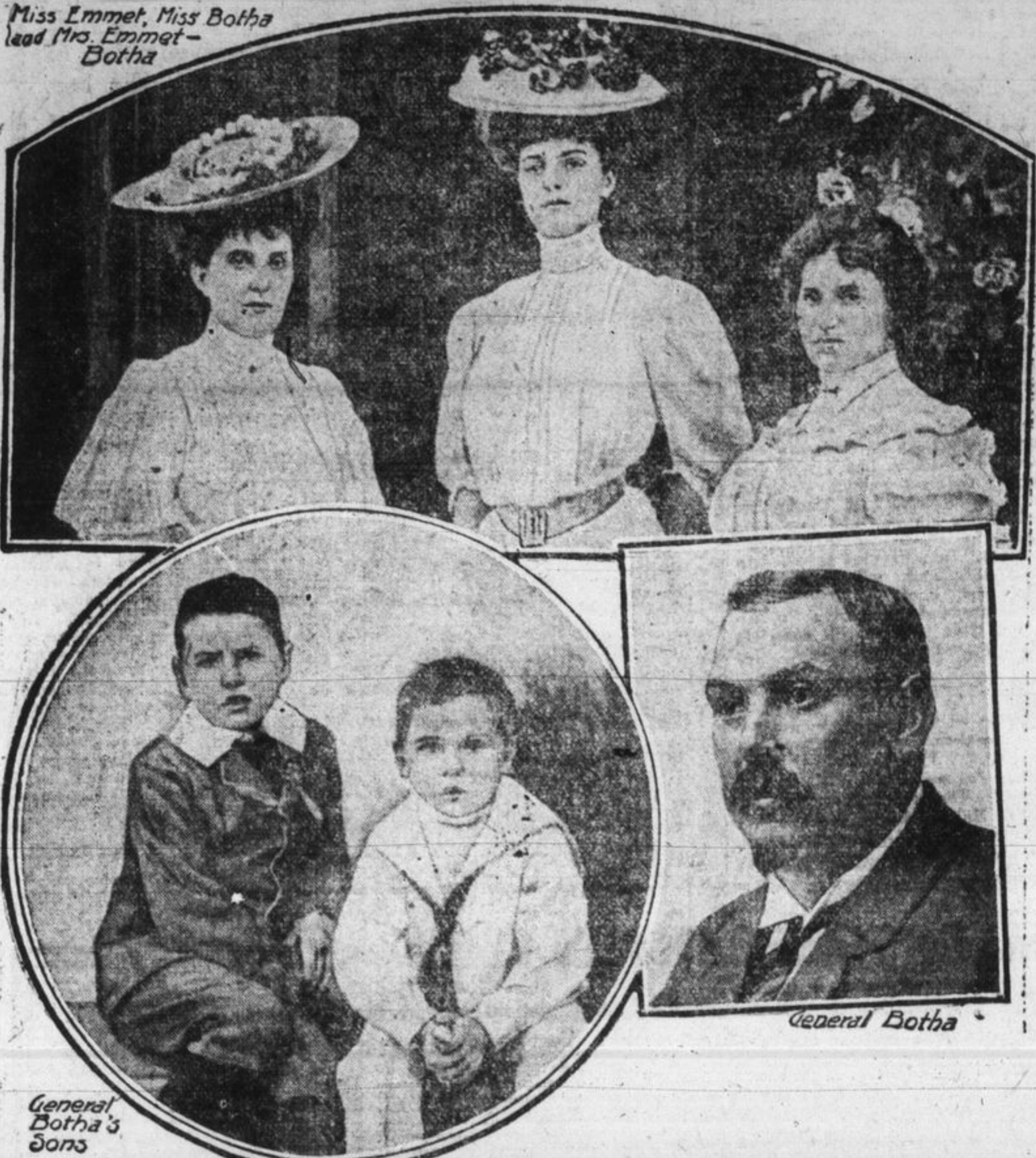
General Botha's Sons

ENGLISH SOCIETY SHOWERS London, April 24.—Of all the colonial premiers assembled in London for the imperial conference, none has met with a more cordial reception than Gen. Louis Botha, prime minister of the new Transvaal colony, who a few years ago held the Boer forces in the field against Lord Roberts.