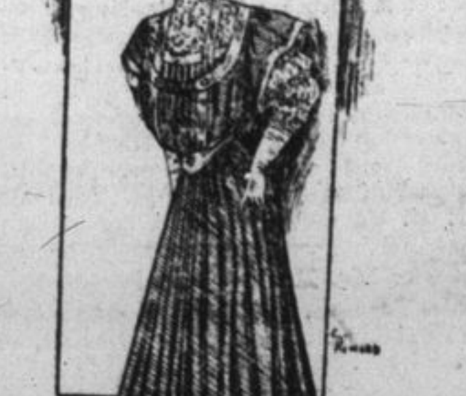
Gown of Veiling.

Watery Blood Nerves are Weak Face is Pallid You Lack Strength You Look Sickly. Until You Ironize and Fortify the Blood There's No Hope of Cure. Thousands of tired workers need the invigoration, the strength, the nerve-force which Ferronize can supply. Ferronize imparts strength because it nourishes. Ferronize is able to nourish because it supplies to the blood the elements it lacks. The staid had a platted panel in the middle of the front and back, the fullness at the sides being laid in small gathers. A group of tufts finished the bottom. The corsage was trimmed with shaggy bands of the silk, a piece of embroidered veiling connecting the rounded ends of two of these straps in the middle of the front. Narrow dark blue velvet ribbon also was run in vertical lines between some of the straps in the front and back. The yoke was of chantilly lace, the undersleeves being of net, shirred to bands of lace matching the yoke.