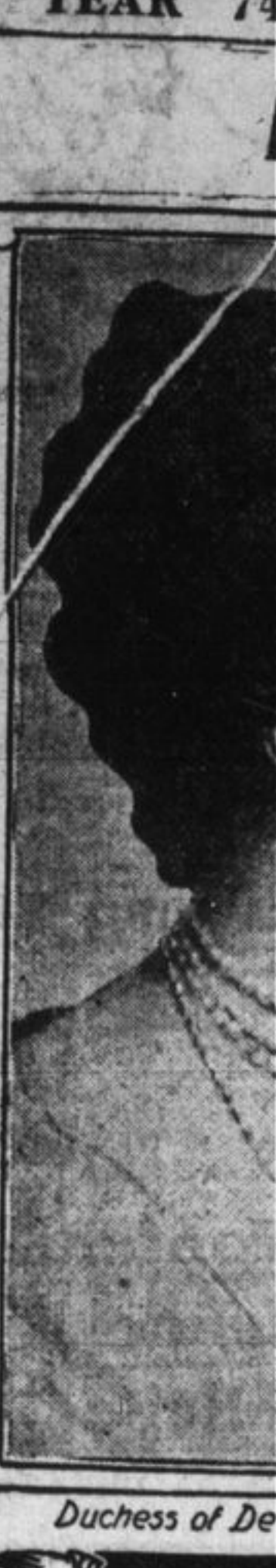
Duchess of De

P.S.—A new stock of Trunks just arrived.