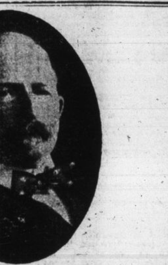
SIR THOMAS SHAUGHNESSY.

contract would be made between the federal government—and somebody's railroad. They begin without noise to strengthen their bridges, cut down their grades, to ease upon the curves. Wherever the line could be shortened they built a cut-off. While this work was going on, they were having erected the largest and what promised to be, the swiftest locomotives ever made. Came now to the presidency of the Rock Island, a man who has worked his way up through the traffic department. He was by nature geared to about a mile a minute, but practice had quickened his pace, his nature and training made him keen on the traffic sent, but he knew the traffic was worth nothing unless he could handle it, and handle it quickly. He began, as Charles M. Hays began to quicken the Grand Trunk—he began at the bottom. When the road was in shape or getting into shape, he robbed his big rival of a Master Mind, and set him over the operation of the road. About this time people began to stop and look when the Rock Island's Rocky Mountain Limited went by. Mr. Harriman had come into control and he began to loosen up, and the men in charge put the money where it would do the most good. Some people said the western roads had gone