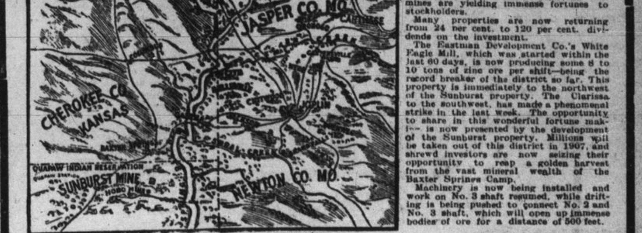
MAP OF DISTRICT SHOWING SUNBURST MINES.