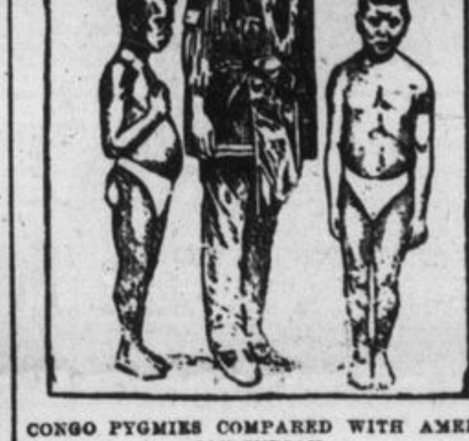
CONGO PYGMIES COMPARED WITH AMERICAN INDIAN.

The professor is not the first ethnologist who has noted the popularity of cat's cradle among primitive peoples. It is even said that pious missionaries while waiting to be chopped up and boiled for dinner by dusky savages whom they failed to convert have observed these simple-minded people killing the time before the feast by playing with loops of string and making the cat's cradles just as the very little folks do in Canada.