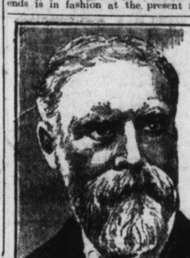
HON. JAMES BRYCE. Author of "The American Commonwealth" Ecuador's new Ambassador to Washington.

New York, Feb. 2.—The French models have given out and the shops have a most interesting look with only a few imitations to remind one that here are to be found the creations of the great Callot, Doucet and Jacqueline are not to be seen until the dressmaker flock of birds migrate homeward from Paris with their new spring creations.