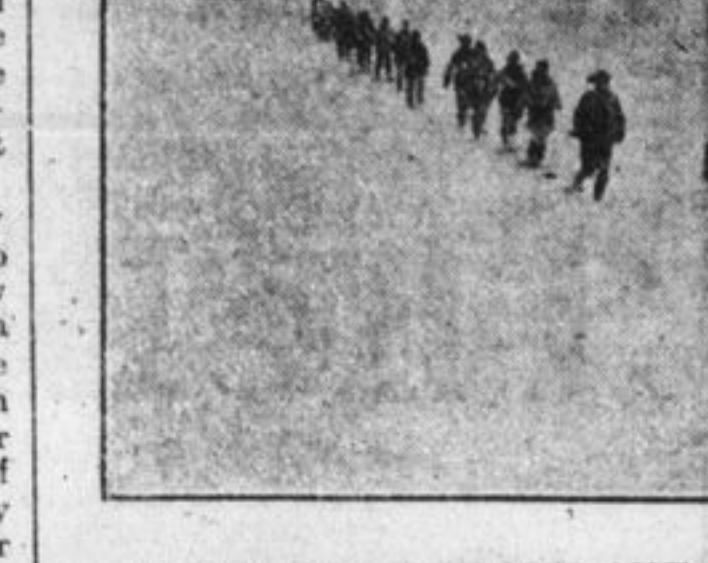
A SNOWSHOE TRAMP OVER THE ST. LAWRENCE RIVER.