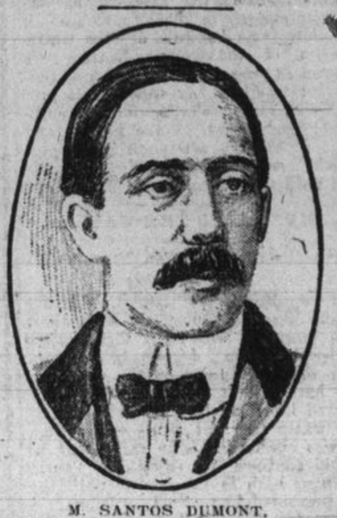
M. SANTOS DUMONT, The noted aerial navigator who states that air machines will control the traffic of the world in the near future.

Noisy Groups, Carrying Red Banners, Gather in the Streets - Police Out and Troops in Readiness For Outbreak.