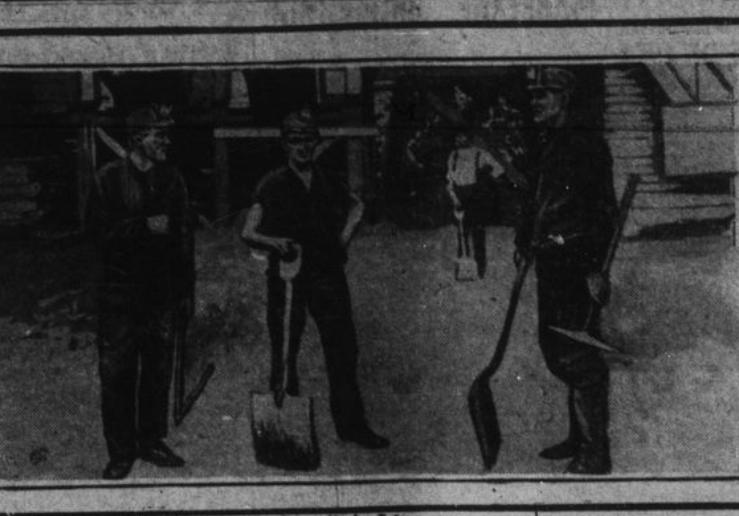
Scope of the Fibers who Own their Jobs.

About one thousand feet of rail was necessary to make the spur, and for this, it is stated, the railroad company demanded $3,000. The mine-owners are still pegging along without their spur.