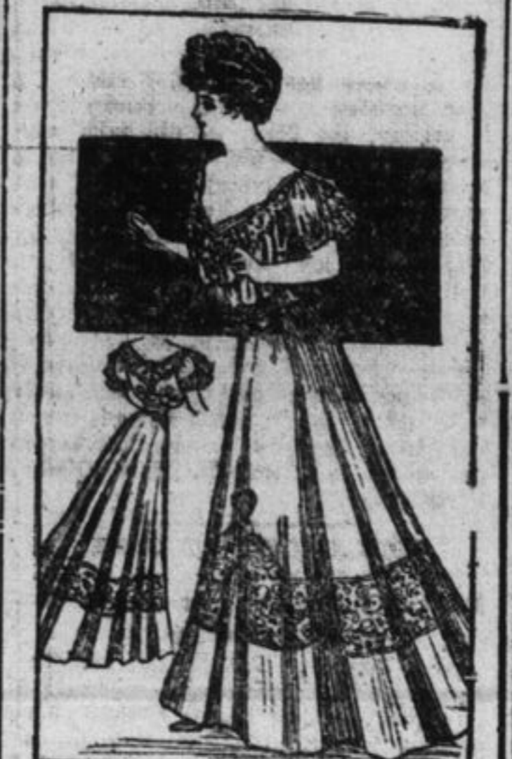
Evening gown of satin finish silk or satin trimmed with cream lace. The skirt was made on a gored circular pattern quite flaring around the lower part and had a wide band of lace in set, the edge of this lace being finished by a narrow roll fold of the silk. The lace was cut with a rounded scalloped edge, and had a pointed berth of the lace about the upper part, with flat folds of tulle inside. On each side of the front two little flat bows were slipped through tiny buckles of ribbons and attached to the lace. The sleeves were opened to the shoulder, the space up the outer arm being filled with a narrow ruffle of lace on a foundation of thin silk muslin or chiffon.