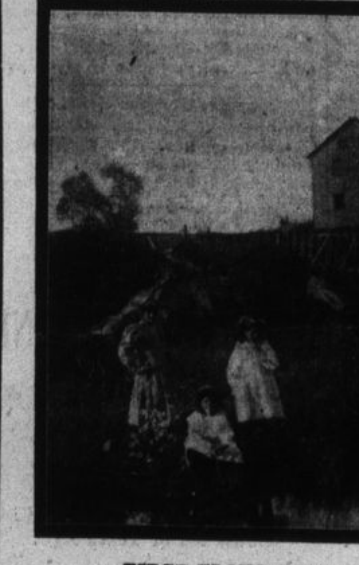
FIRST FLOUR MILLS IN ONTARIO, 1786.

Toronto Globe. There are few more historic places in Canada than the city of Kingston. It is the spot in Upper Canada, on which the hand of civilization has been longest laid.