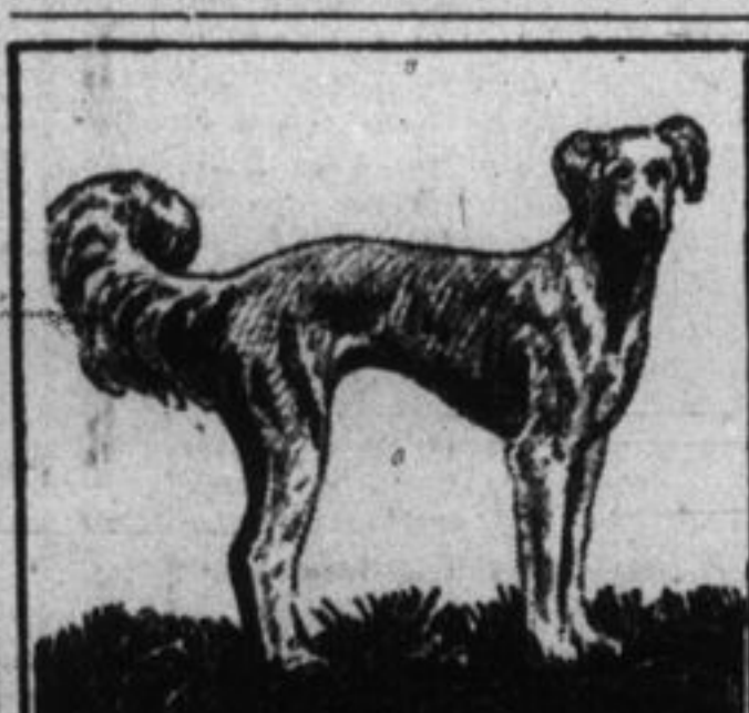
Among the wedding gifts to Queen Ena of Spain was a handsome Egyptian gazelle hound (Sighth), presented by the King of the Belgians. The number of these dogs at the wedding was 100. They are quite rare and, on account of their great alertness and great attention wherever they are exhibited.