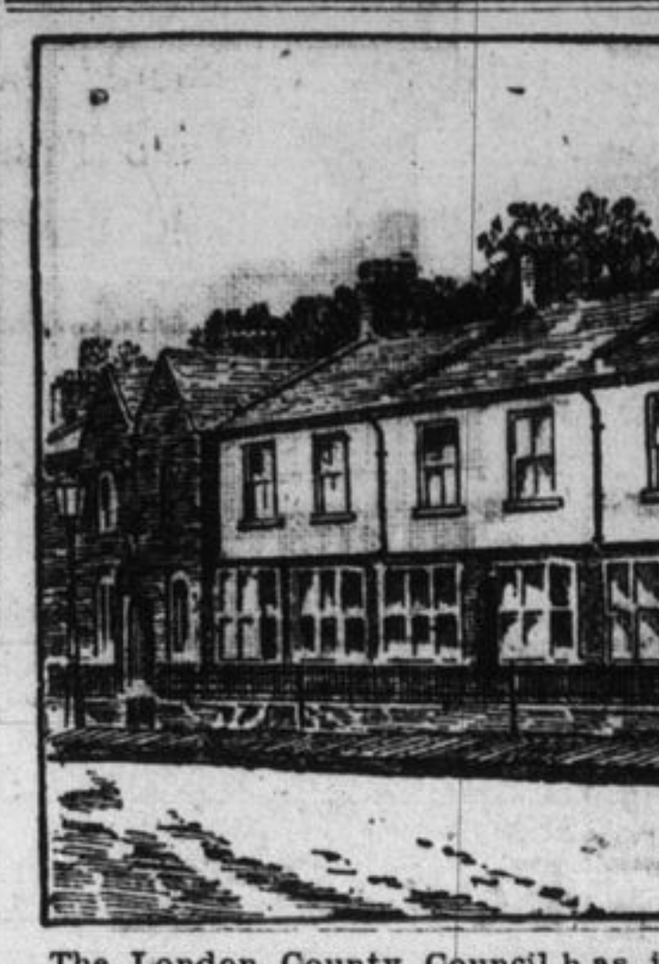
Attains This Year, Jubilee of Its Institution.

NATION STRENGTHENED BY TIES OF MARRIAGE. Our King and Queen Connected With Pretty Nearly All of Europe - England Has a String on Most of Continental Thrones. London, June 8.—The marriage of King Alfonso of Spain, and Princess Ena of Battenburg, has added another distinguished country to the list of Britain's relations by marriage. Many continental rulers during the last fifty years have secured their thrones from among the members of the royal family, and, as a result, King Edward and Queen Alexandra are connected by the closest ties of kinship to the sovereigns of nearly all the principal states of Europe. King Alfonso has thus many precedents to go upon in marrying one of Britain's daughters. It is interesting to note that by this marriage the king of Spain will become related to the czar, the German emperor and the monarchs of Denmark, Norway, Sweden,