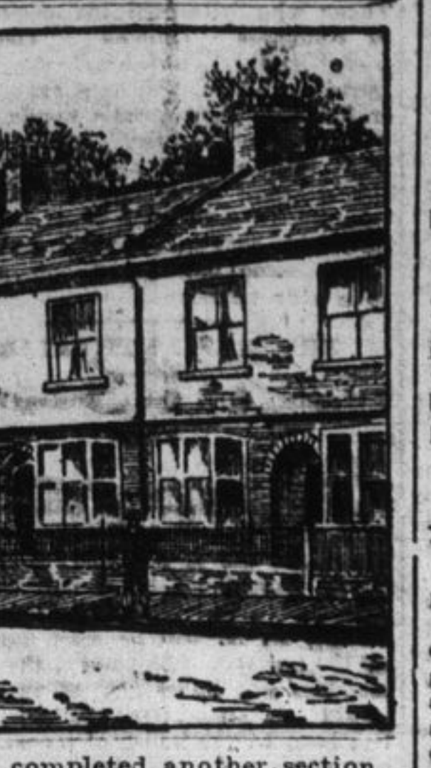
THE CHILDREN'S FRIEND.

The One That Contains the Most Gluten. Garden Magazine suggests, take it for granted that the best potatoes are the ones that contain the most starch. On the contrary, it is the ones that contain the most gluten, because gluten is an albuminous food and starch is much cheaper than albumen. First comes the skin of the potato. In a new potato it is thin and clear; while a corky skin indicates a mature potato, and one more likely to be unweedy. Second is a thin layer varying from one-eighth of an inch to one-half an inch in thickness. This is the gluten. Third comes the largest part of the potato—the starch. If this is very dense the potato will be unweedy, but if non-uniform the potato will be of poor quality. Fourth is the very centre of the tuber, which contains little starch and a great deal of water. If this area branches out into the starch and the potato will not be a good cooker.