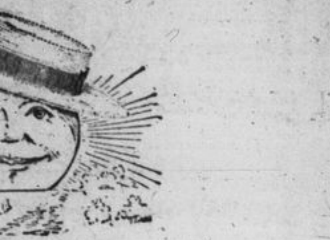
The H. D. Bibby Co.

ful, Refreshing Linaris of Table Waters"