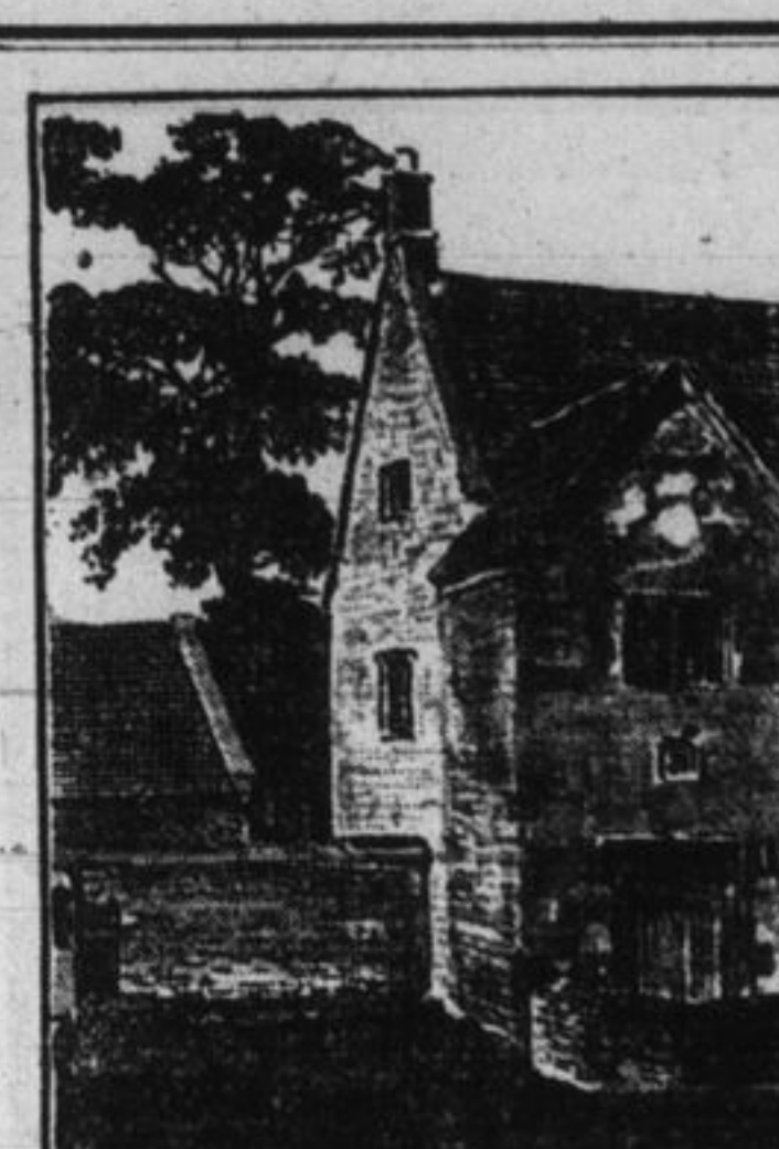
It has been reported that some vandals had stolen the escutcheons of the Washington family, which adorned the entrance hall of the Sulgrave Manor House, the ancestral home of the Washingtons from 1535 to 1606. The picture shows the escutcheons above the door.

Princess Patricia, Who is Reported to Have Rejected King Alfonso, Pines for Young Nobleman Already Engaged. London, Feb. 21.—A royal princess, King Edward's niece, has fallen so desperately in love with an immensely wealthy young nobleman that she is ready to renounce rank, title and precedence to make him her lord. But were she a village girl she would be no nearer her heart's desire, for the man of her heart loves another. And the worse for him, the princess' father has informed him that he would welcome him as a son-in-law.