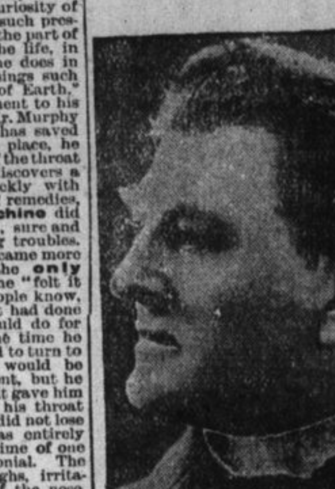
Joseph Murphy, Veteran Actor

only good for the throat and lungs, but is good for stomach troubles, and acts as a general tonic to the system. For checking the symptoms of the early stages of disease, nothing ever prescribed is so efficacious as PSYCHINE. Sold all over Canada, by every druggist in the Dominion, for $1 per bottle.