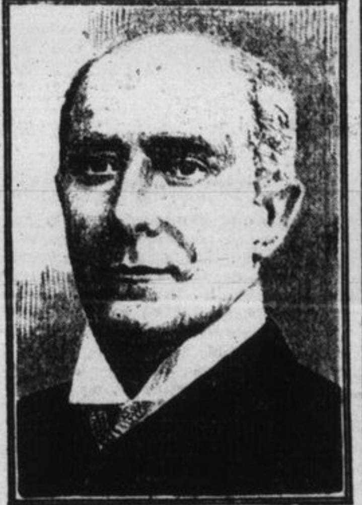
WILLIAM M. IVINS. The republican candidate for Mayor at the last election in New York, who made such a determined fight against the Tammany Hall machine, and the one side and the radical municipal ownership element on the other hand.

The two other murderous despots are a constant menace to our prosperity and peace; since describing the relentless vengeance of the Black Hand last week and its shocking barbarities of the Chinese assassins, two events have occurred that have filled