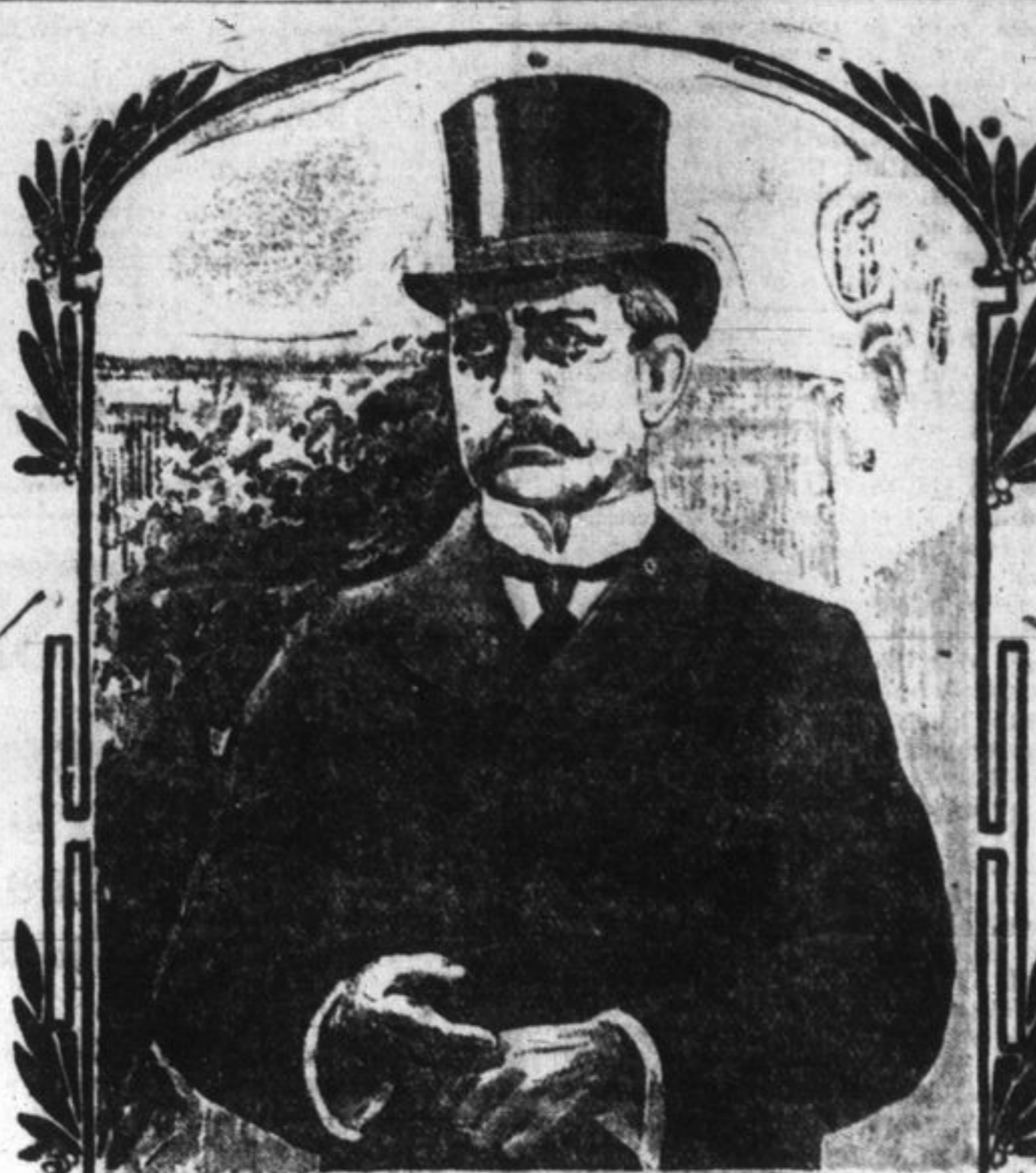
The latest photograph of Elihu R. Root, the new Secretary of State.

WERE-WOLVES AND VAMPIRES As Described By An English Banker. From the earliest ages of the world the occult arts have been practised under varied designations, and in many diverse forms, the east especially having been for many ages the home of magic and sorcery. Even at the present day the most astounding tricks are performed by jugglers and magicians in India and other eastern countries; amongst the most startling being the ordinary basket trick, which so many have witnessed. The juggler places a large empty basket on the ground, into which a little girl steps, the lid being then closed and fixed. He then apparently pierces the basket through with a long sharp rapier, the weapon soon reeking with blood, while the most agonizing shrieks and gasps horrify the audience, eventually becoming fainter and weaker until, at