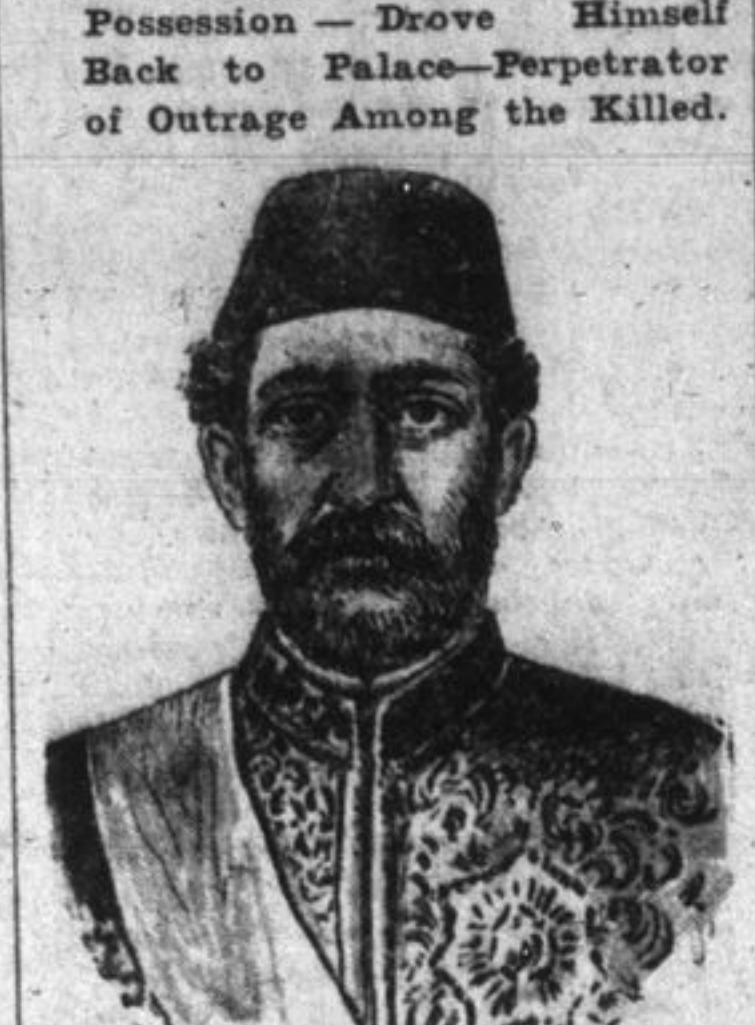
THE SULTAN OF TURKEY.

Sultan Showed Courage and Self-Possession—Drove Himself Back to Palace—Perpetrator of Outrage Among the Killed.