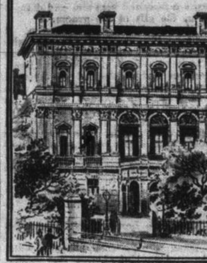
WHITLAW REID Dorchester House

The debate in the senate on "Pub- lic House Trusts," and Earl Grey's public and private utterances, are just what English temperance men feared, bringing this scheme for the control of the drink traffic before the Canadian people. Just about the time Earl Grey landed in Canada, "The British Na- tions Temperance Federation" publish- ing a manifesto, addressed to "The Temperance Organizations of Canada." The federation embraces thirty-three temperance societies of England, Ire- land, Scotland and Wales, and includes the large bulk of the working forces of this great reform. The president is A. Cameron Corbett, M. P., and amongst the vice-presidents are the Countess of Carlisle (president of the English W. T.C.U.) and twenty-seven members of parliament. Let the manifesto speak for itself. "Dear Friends,—We hear with deep regret of a disposition on the part of some in Ontario to favour the crea- tion of a public liquor monopoly, whereby philanthropic and religious people may be induced to join in the setting up of a so-called "Reformed Public-house Trust System," or, in the creation of a state, or municipal or other public monopoly in or for the sale of intoxicating drinks—whereby the entire community become implicat-