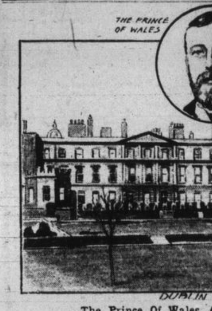
THE PRINCE OF WALES DUBLIN CASTLE

TWO CHILDREN MYSTERIOUSLY DISAPPEAR IN VANCOUVER. No Trace Of Them Yet—Rewards Offered—Dastardly Crime Of a Desperate Character—Vancouver's Freedom From Fire.